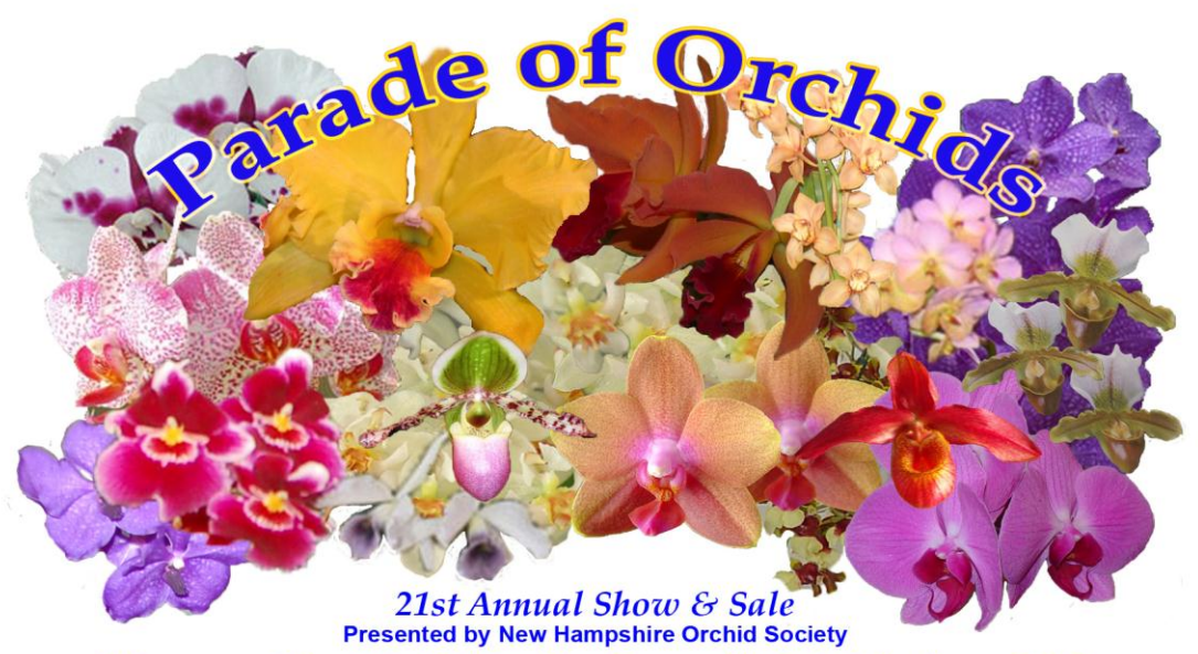
February 10 ~ 12, 2012 Radisson Hotel, Nashua, NH

Please join us at the Radisson Hotel in Nashua, NH, February 10 ~ 12, 2012 as New Hampshire Orchid Society celebrates our 21<sup>st</sup> Annual Show with a spectacular exhibition called Parade of Orchids.