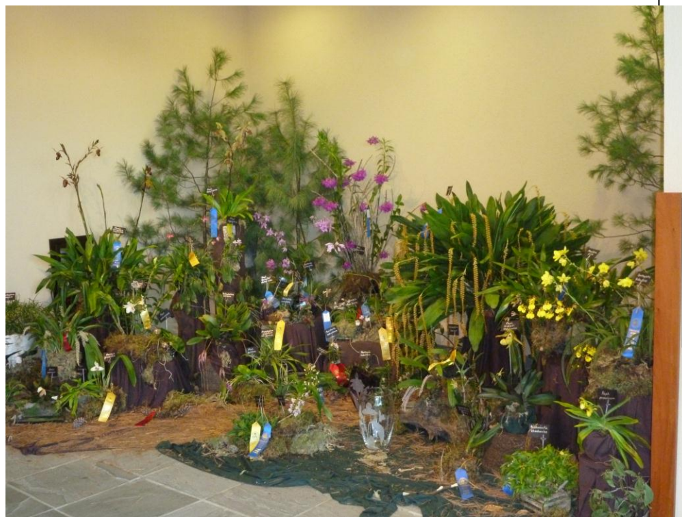
NHOS exhibit at the MOS show compliments of Sue Andersen.