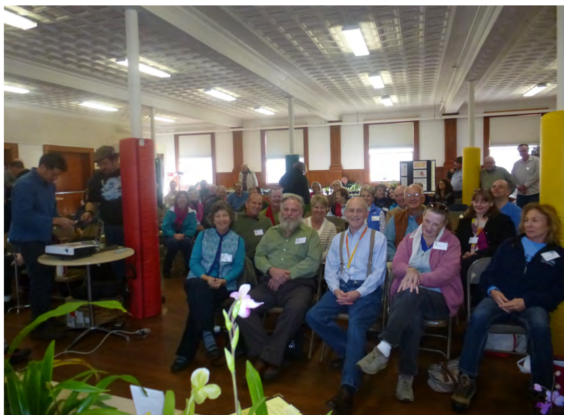
November meeting.