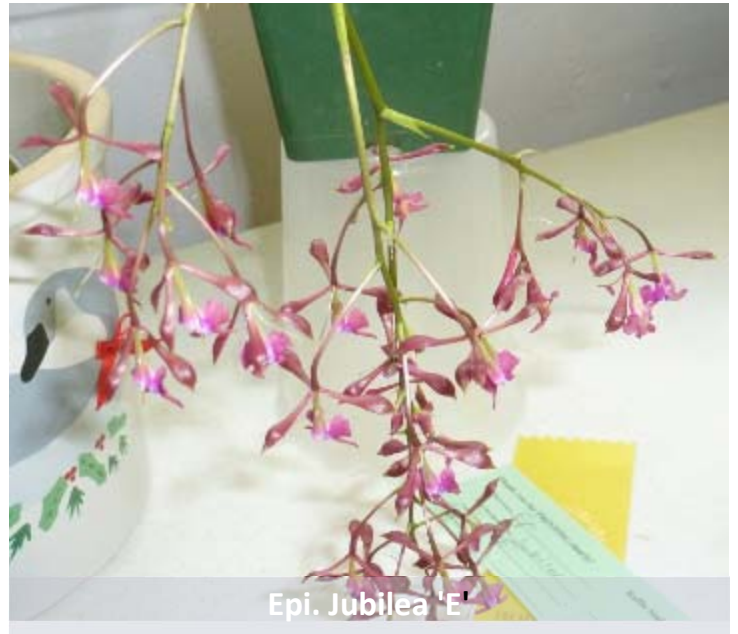
Epi. Jubilea 'E'