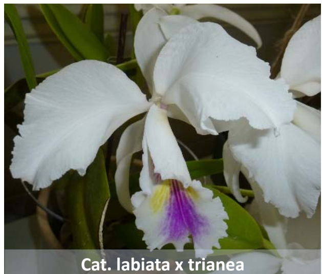
Cat. labiata x trianaea