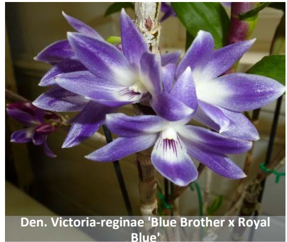
Den. Victoria-reginae 'Blue Brother x Royal Blue'