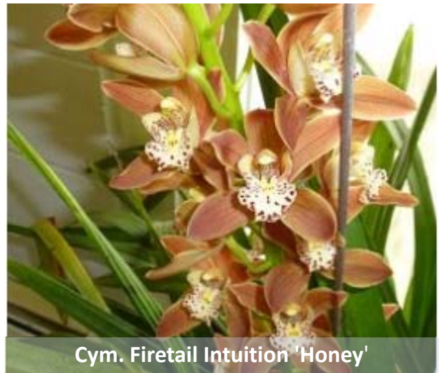
Cym. Firetail Intuition 'Honey'