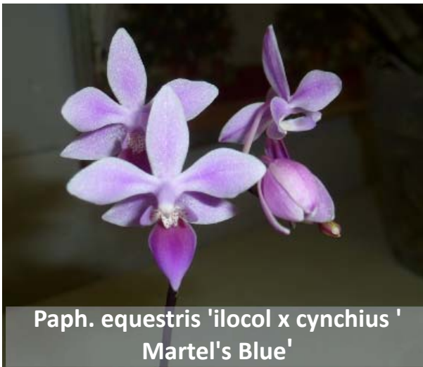
Paph. equestris 'ilocol x cynchius ' Martel's Blue'