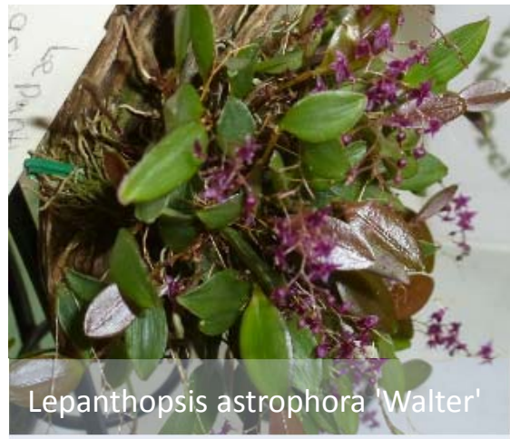
Lepanthesis astrophora 'Walter'