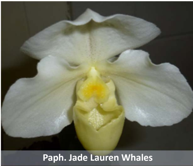
Paph. Jade Lauren Whales