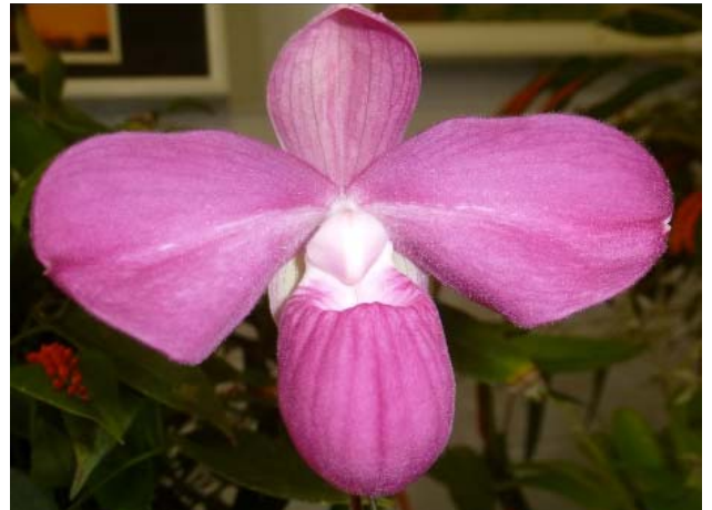
Phrag. Lyne Goldwerx x Phrag. Kovachii