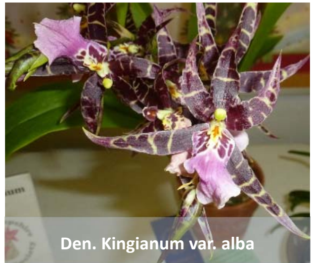
Den. Kingianum var. alba