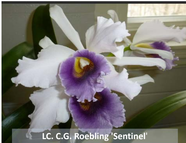
LC. C.G. Roebling 'Sentinel'