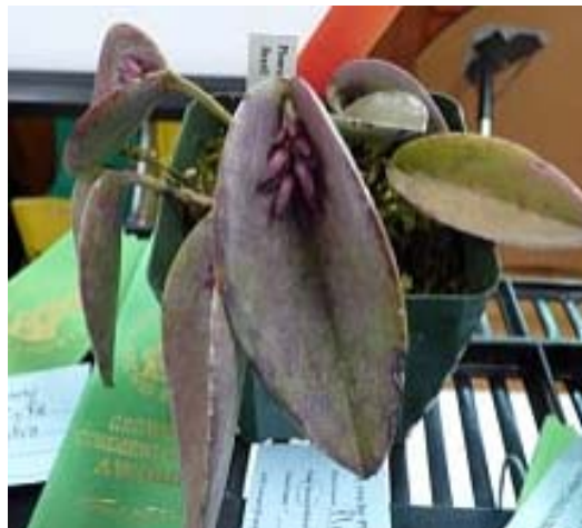
Figure 11 Bulb. phalaenopsis (stinky)