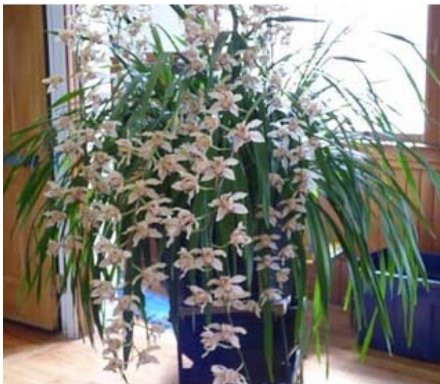
Cymbidium "Kassander" CCM/AOS

Next meeting is May 8th where we have our annual auction with plants from nationally known vendors.