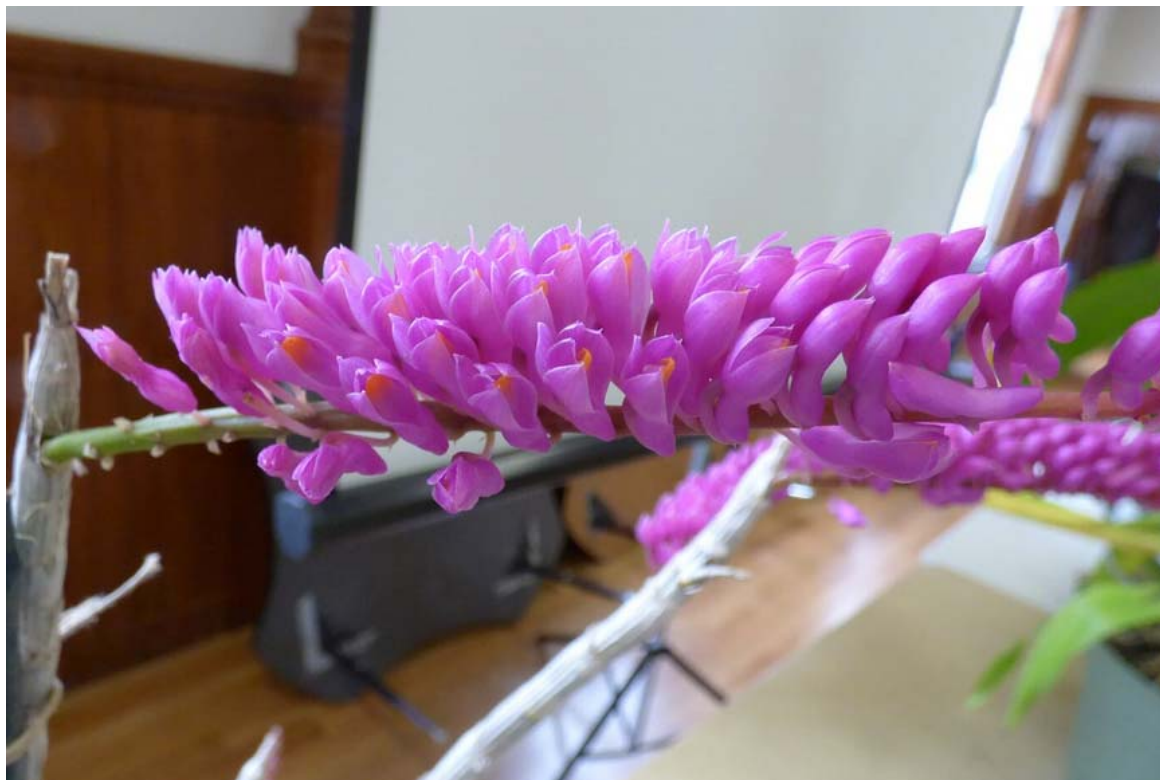
Dendrobium Secundum "Pete's Pride"