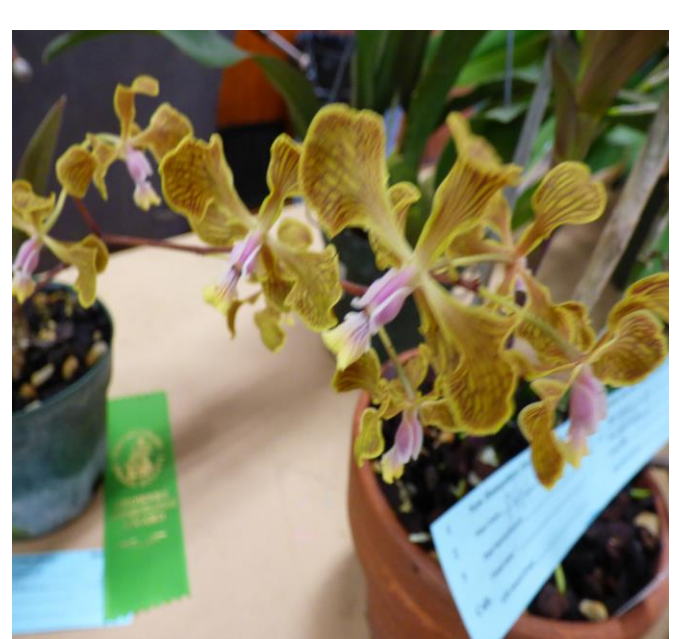
Epidendrum Noel Star Valley