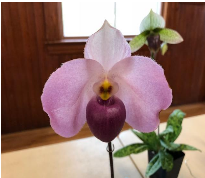
Paph. Ho Chi Minh 'Bob' AM/AOS