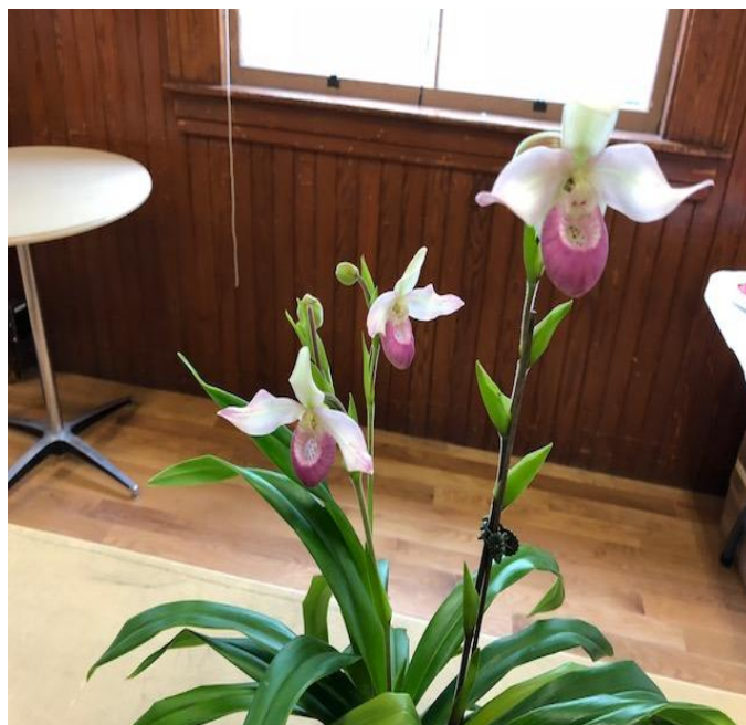
Phrag. Cardinale 'Birchwood' AM/AOS