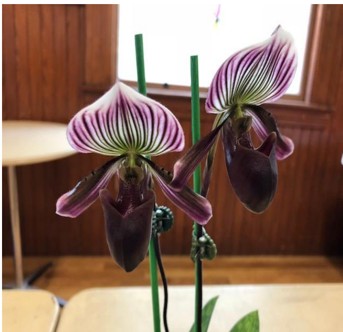
Paph. Barbaturn x sib