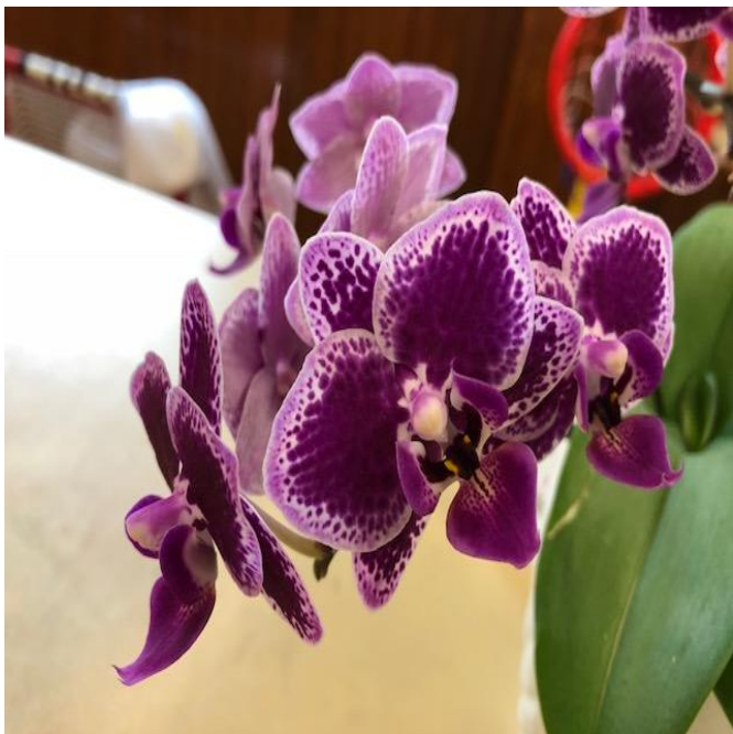
Phal. Chia E. Yenlin 'LH Bo8'