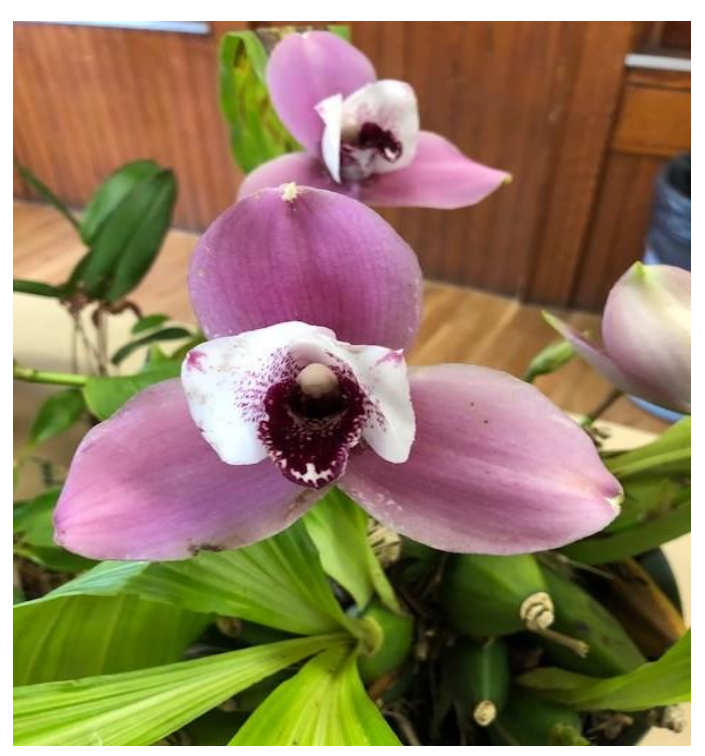
Lycaste ('Auburn' x 'Wyldcourt')