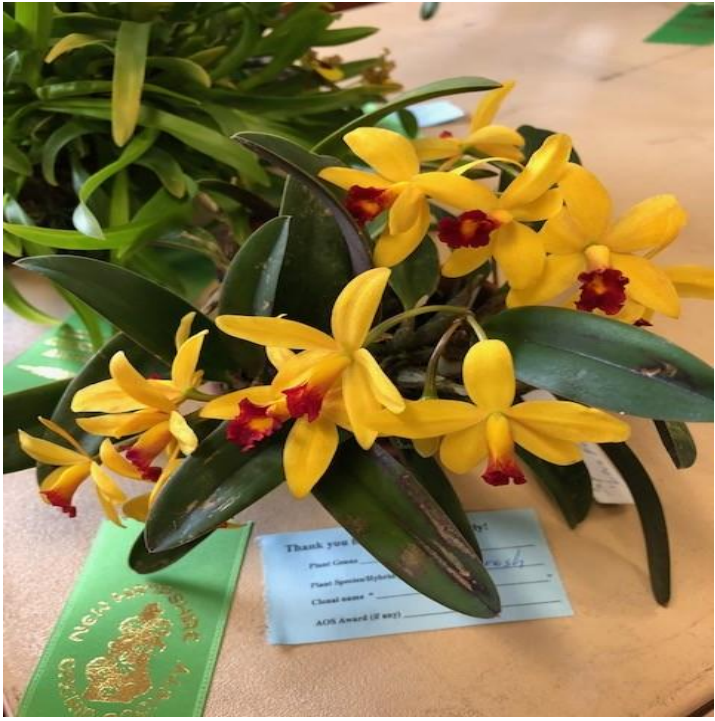
Slc. Love Fresh