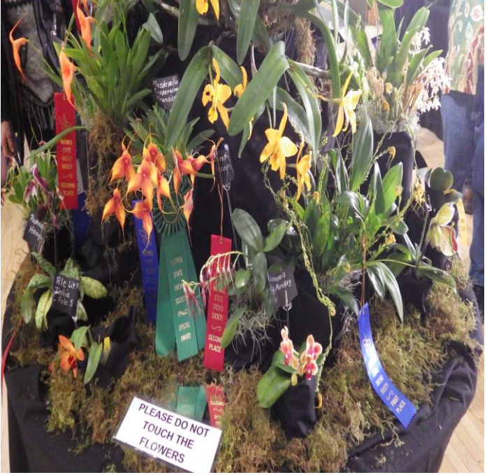
New Hampshire Orchid Society