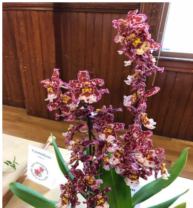
Wilsonara (Oncostele [Ons.] (syn. Burrageara or Burr.) Eye Candy 'Pinkie'