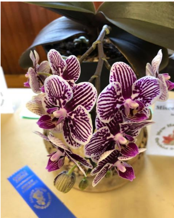
Phal. Taida King Caroline