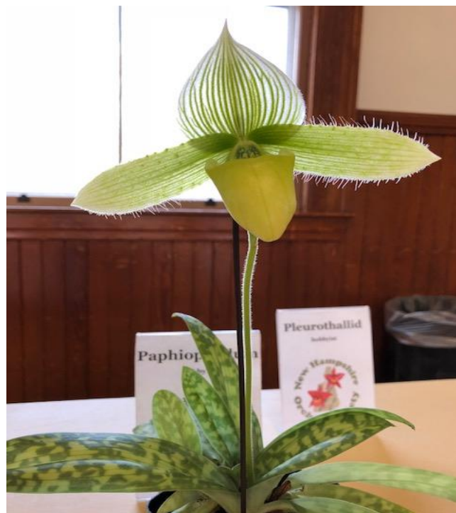
Paph. Spring Moonbeam