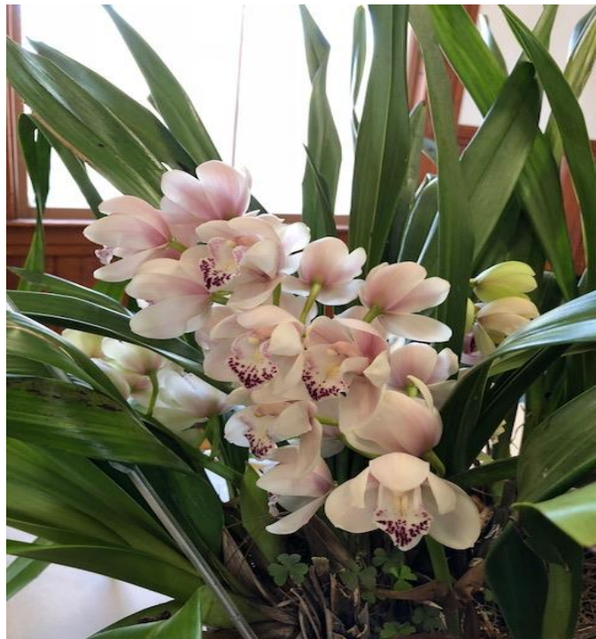
Cymbidium Lady Sarah ‘Strawberry Milk’