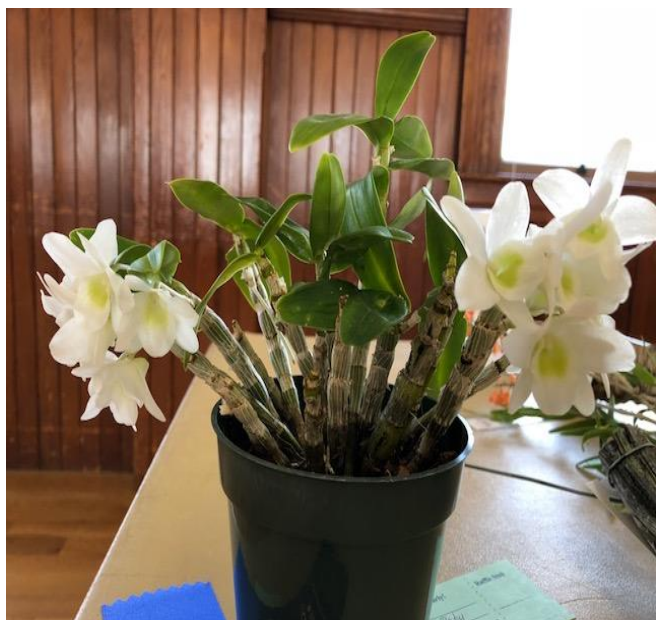
Den. Angel Baby 'Little Darling'