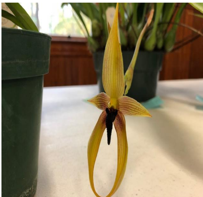
Bulbophyllum carunculatum 'ICC' X "Bulbo. Paluense"