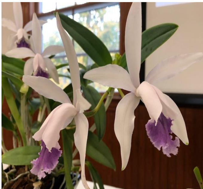
Cattleya intermedia 'coerulea'