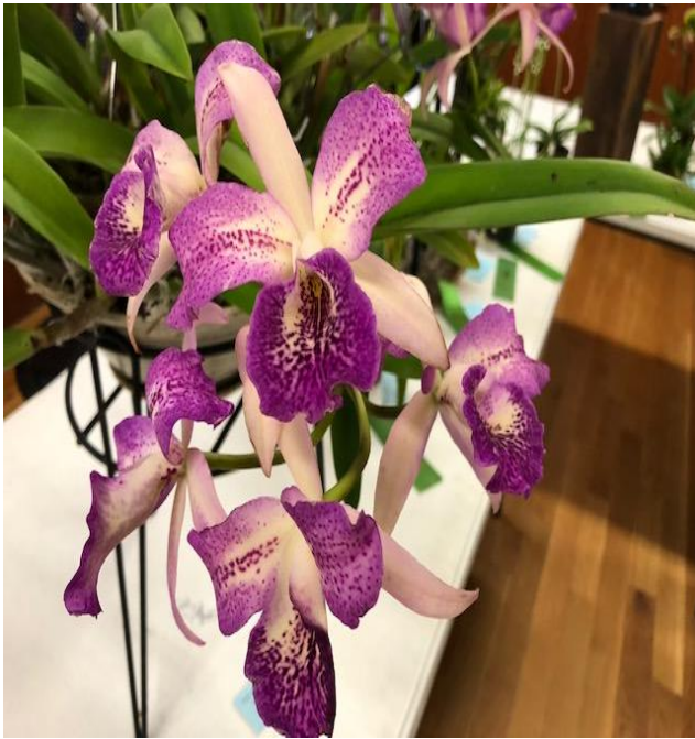
Brassocatanthe Express Worsley 'Bsn. Bill Worsley x C Red Express'