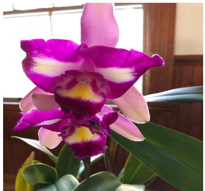
Lc. California Angel