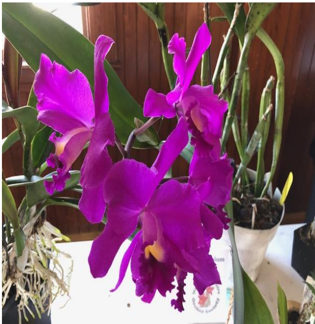
Rlc. Southern Seto