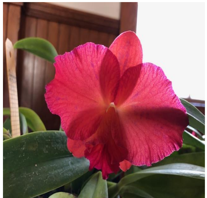
Slc. Circle of Life 'Essence of Elegance'