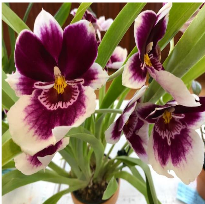
Miltoniopsis Rouge "Picardi"