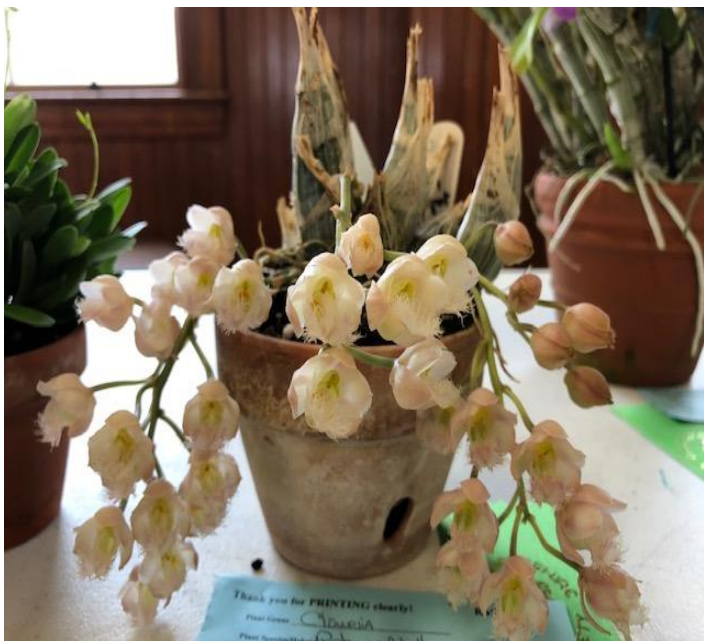
Clowesia Rebecca Northern