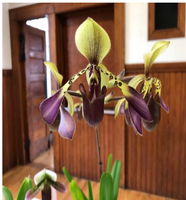
Paph. lowii "Cleveland's" HCC/AOS