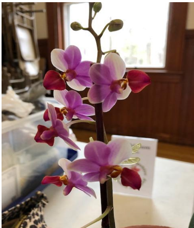
Phal Liu's Cute Angel, AM/AOS