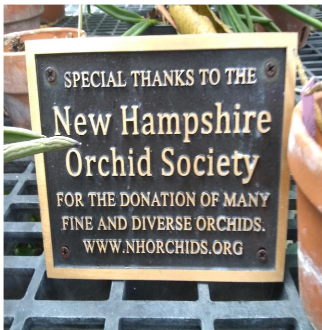
Macfarlane Greenhouse @ UNH