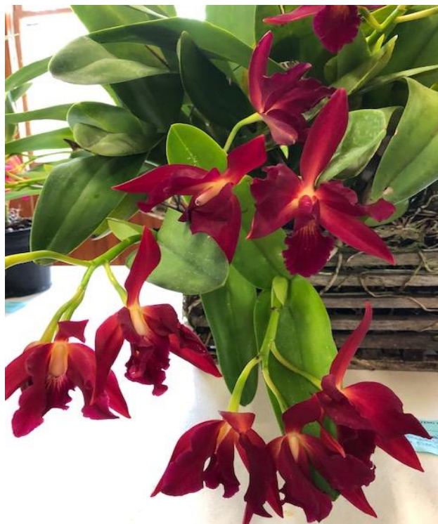
Catt. Jewel Box "Dark Waters" AM/AOS