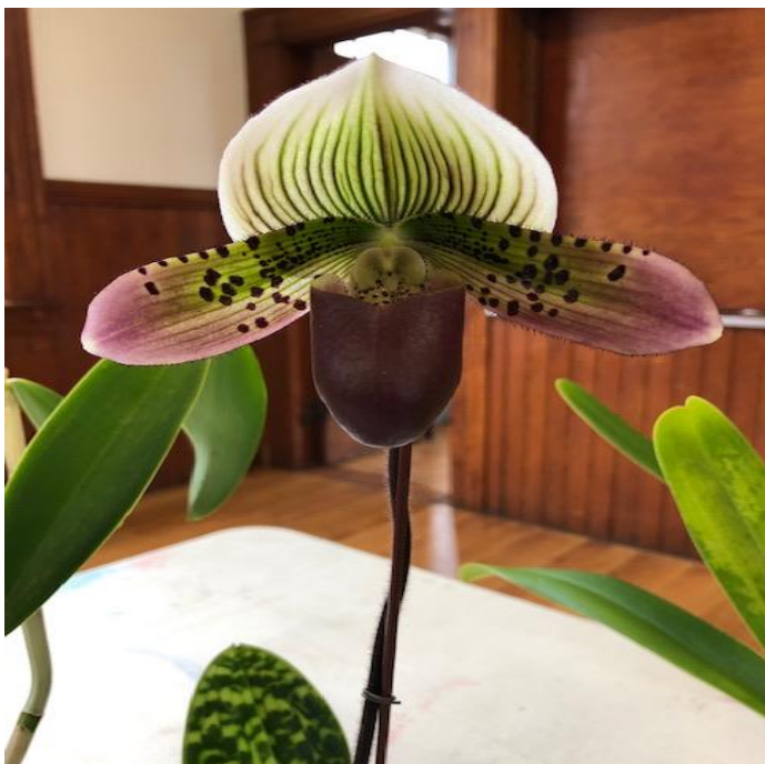
Paph. Voodoo Jewel "Bobs' Surprise" AM/AOS