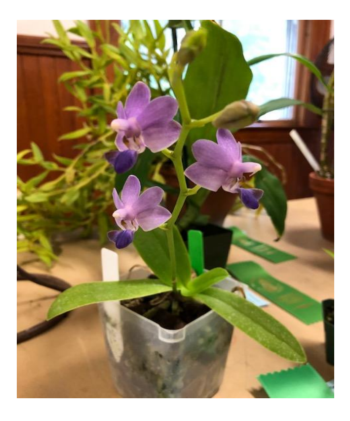
Phal. Tying Shin Blue Jay