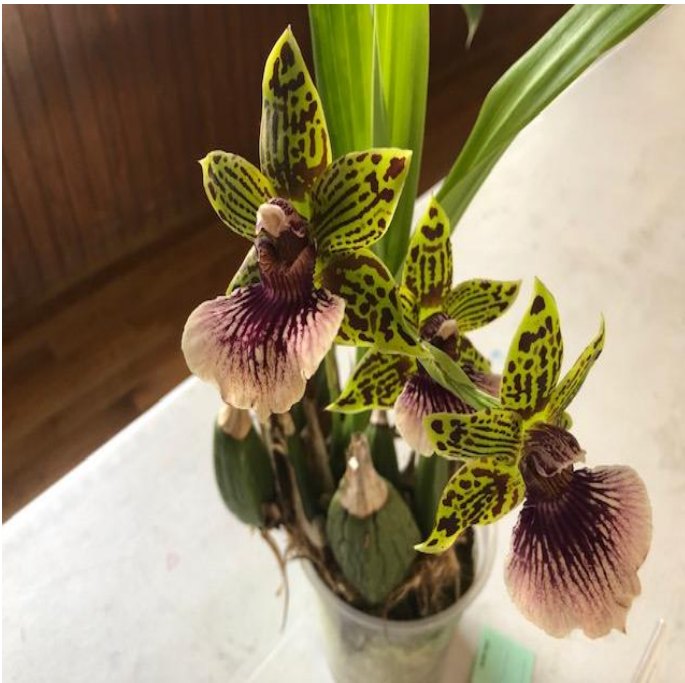
Galeopetalum Parkside 'Starburst' AM/AOS