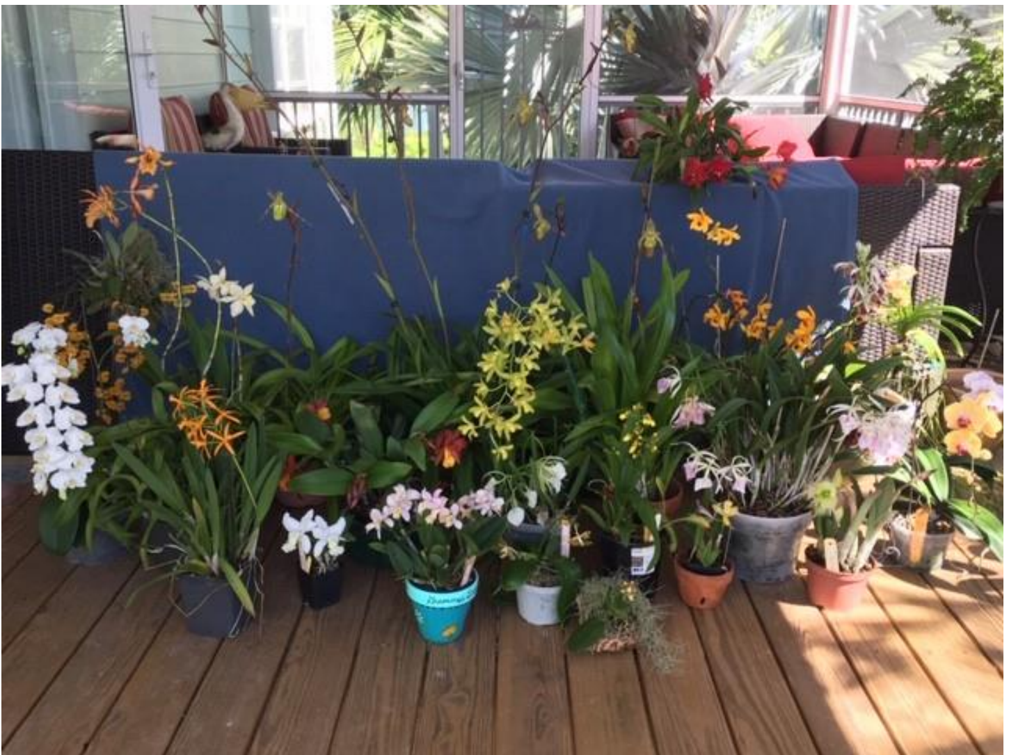
COVID-19 Amateur Orchid Show in the Conch Republic.

WHEN YOU JOIN AOS, DON'T FORGET TO MENTION YOU ARE ALSO A MEMBER OF NHOS!