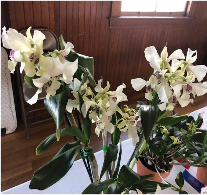
Den. Royal Wings

(Not available)