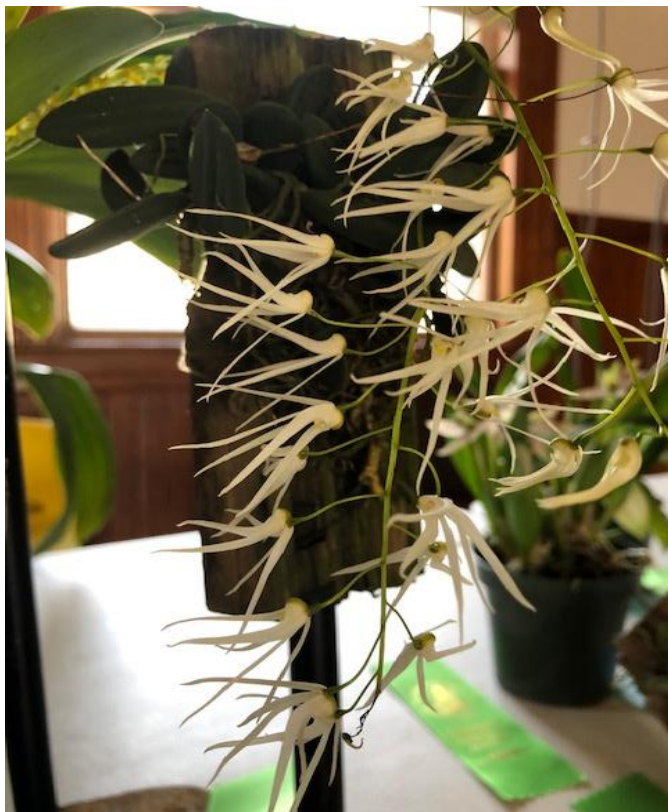
Den. (Dockrillia) linguiforme