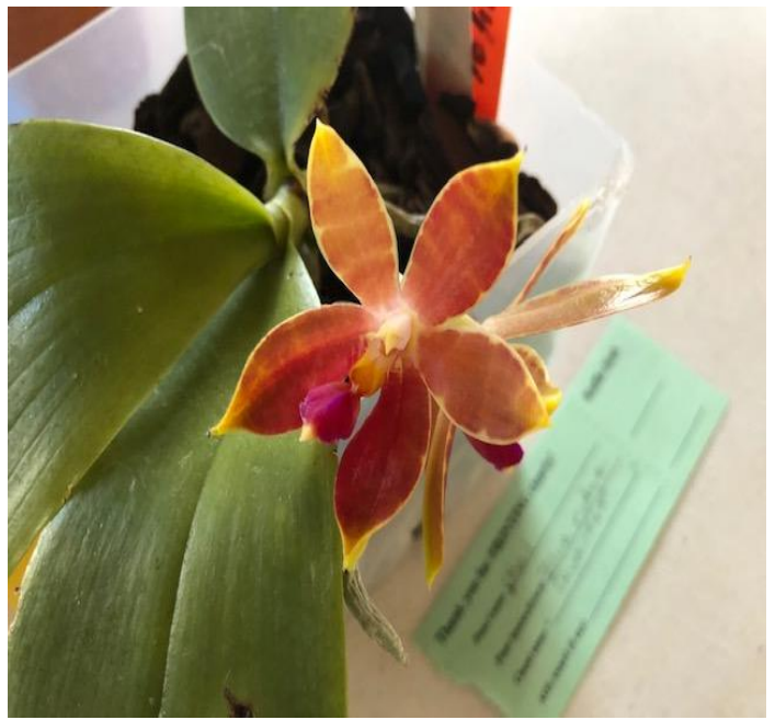
Phal. Blue Ridge Quartet