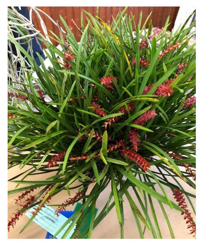
Onc. Heaven Scent 'Sweet Baby'