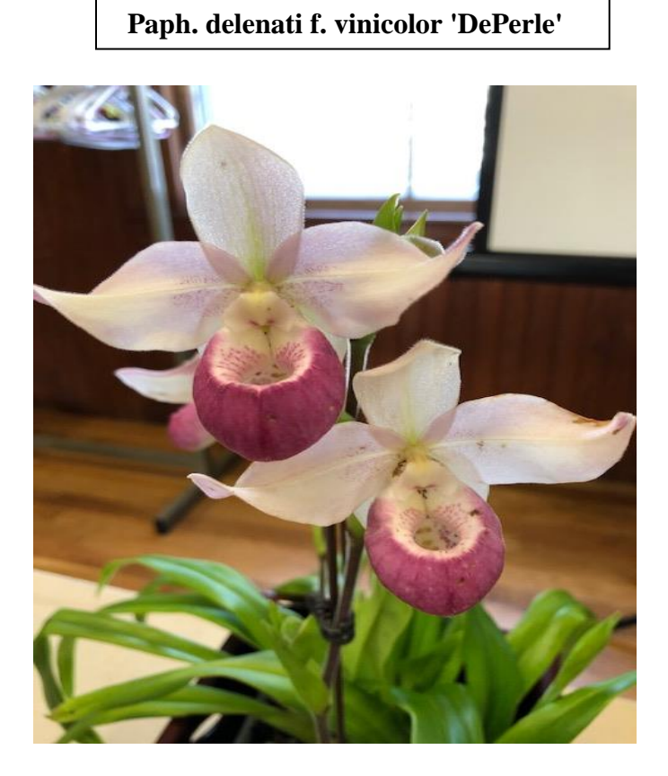
Phrag. Cardinale 'Wilcox'