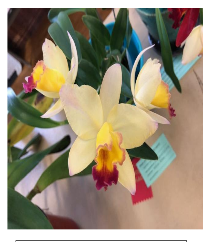
Pot. Eye Candy 'Mellow Yellow' February 2020