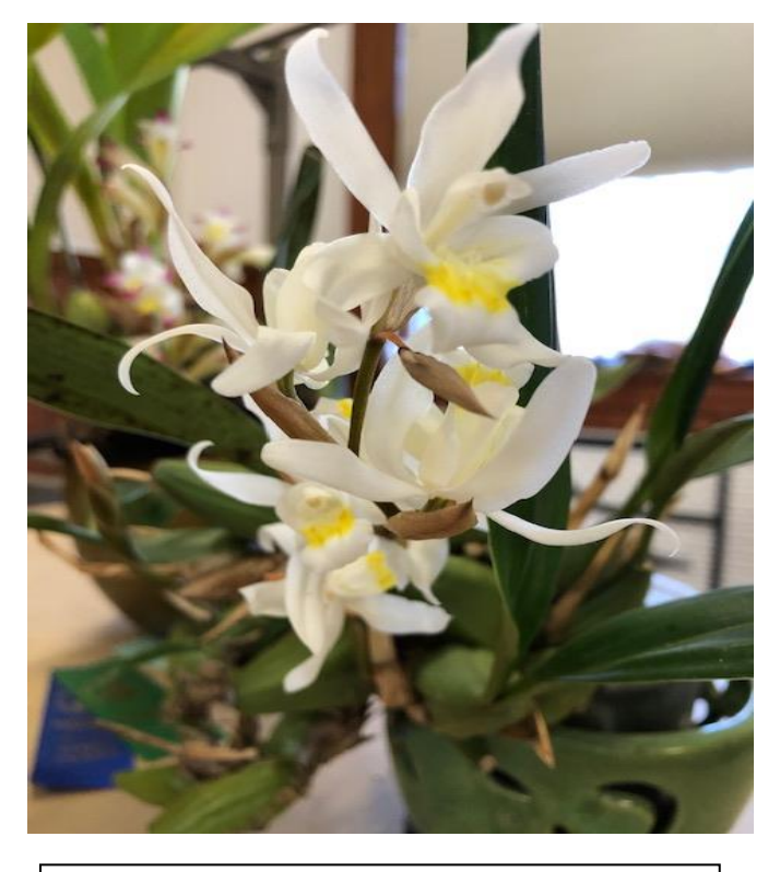
Celogone Unchained Melody New Hampshire Orchid Society