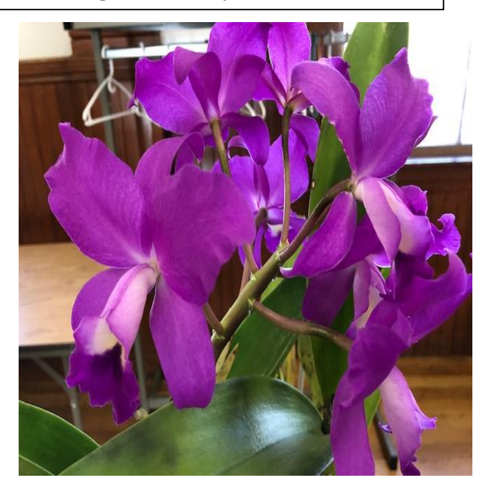
C. Portia (C. Bowringiana x C. labiata)