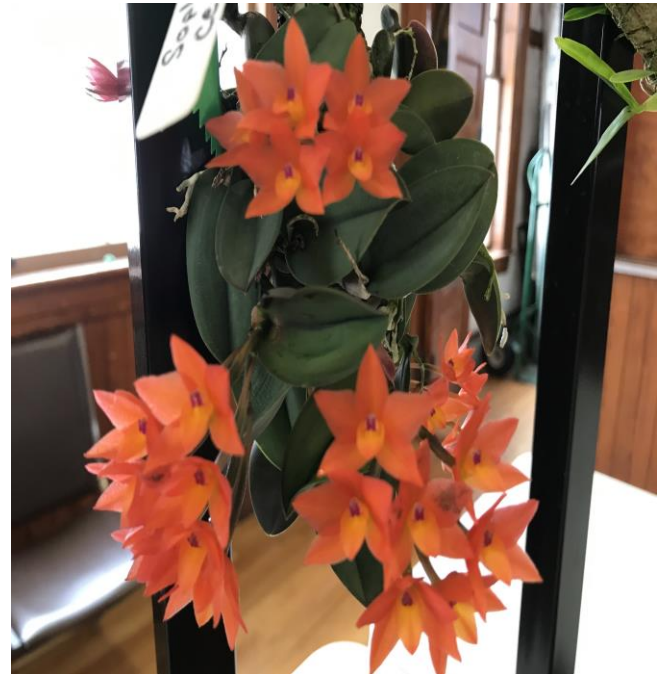
Sophronitis (Catt.) coccinea