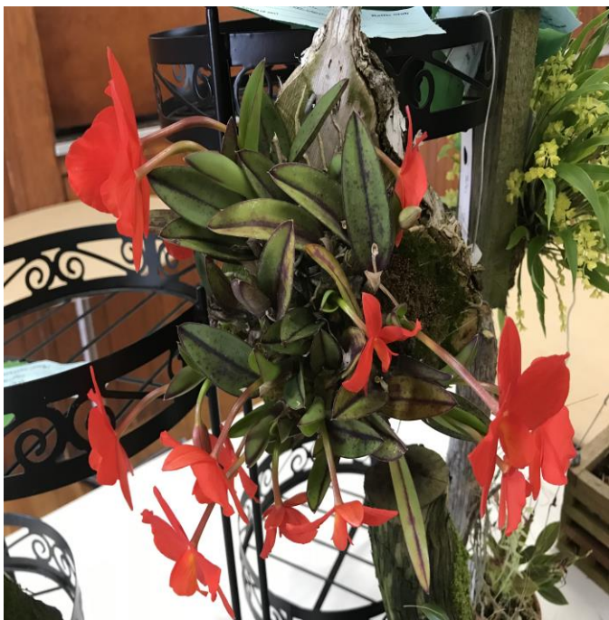
Sophronitis (Catt.) cernua