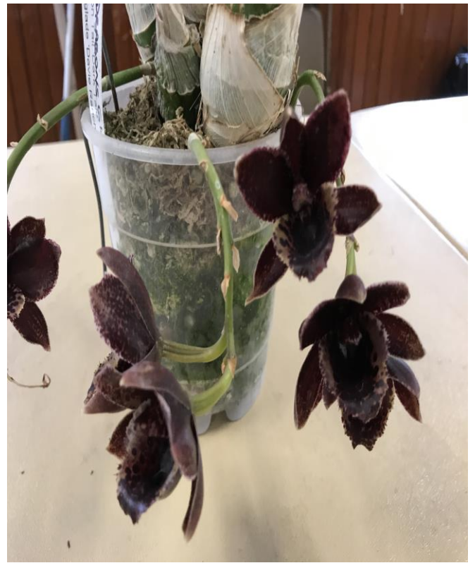
Ctmds. Dragons Glade