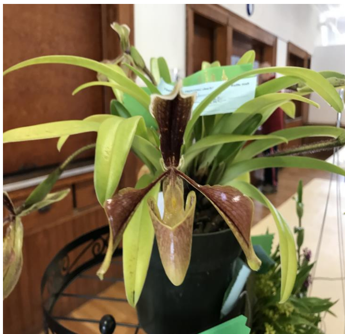
Paph. villosum var. boxallii f. attatum