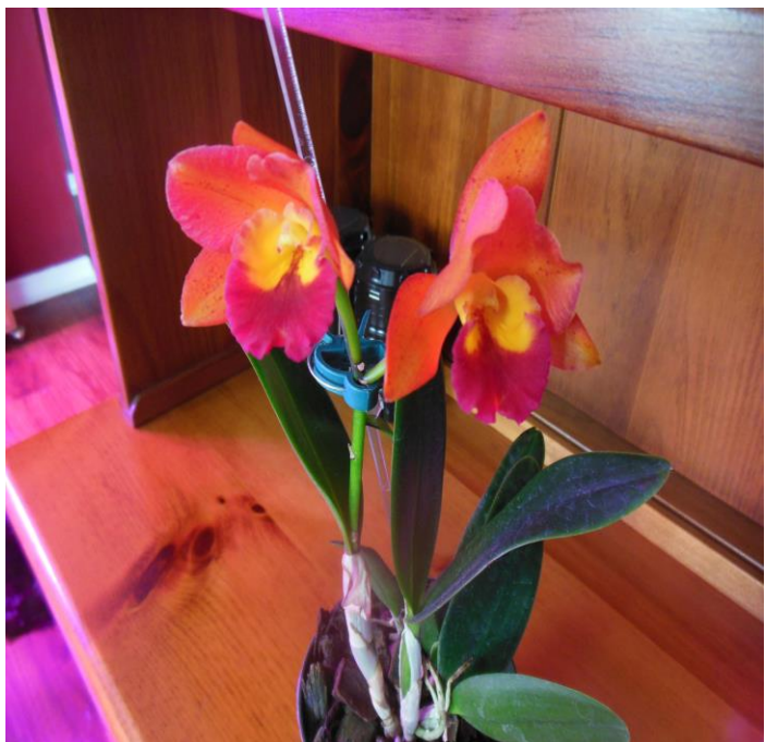
Rlc.Waianae Leopard x Catt.Why Not 'Orange Paradise'