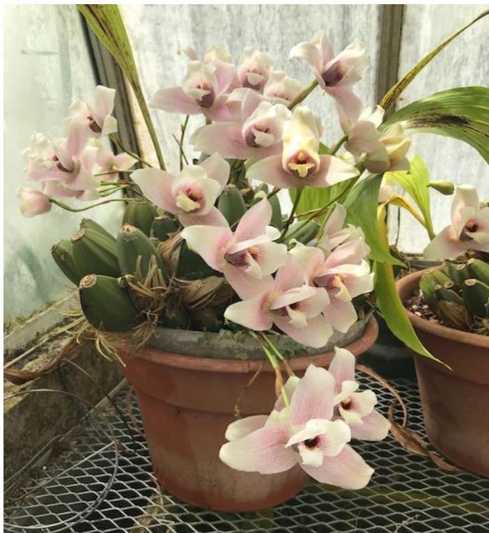
Lycaste Auburn Dark Beauty X Wyldecourt "Sir William Cooke"