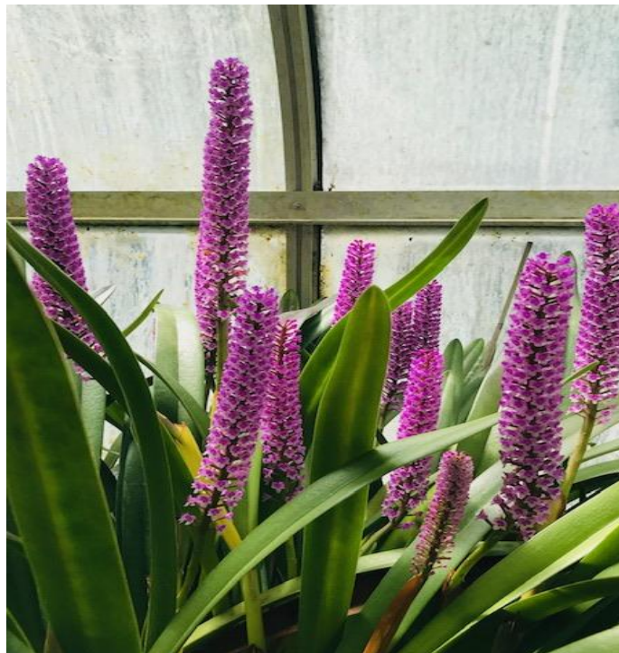
Arpophyllum spicatum George Newman