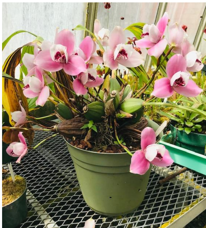
Lycaste imchootiana "Royal Blush"