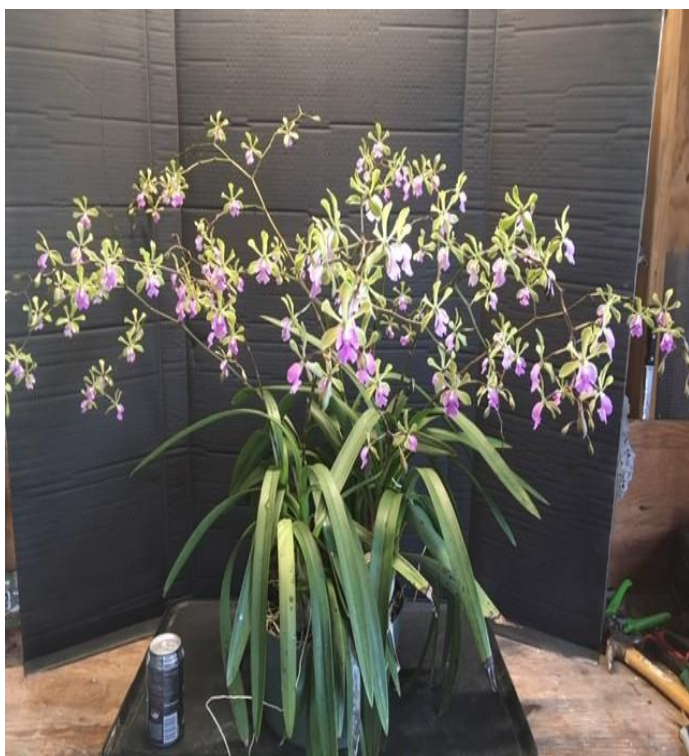
Epicyclia Serena O'Neill Leigh Coolidge