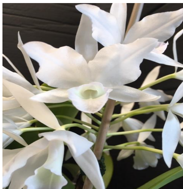
f. alba 'Debbie'