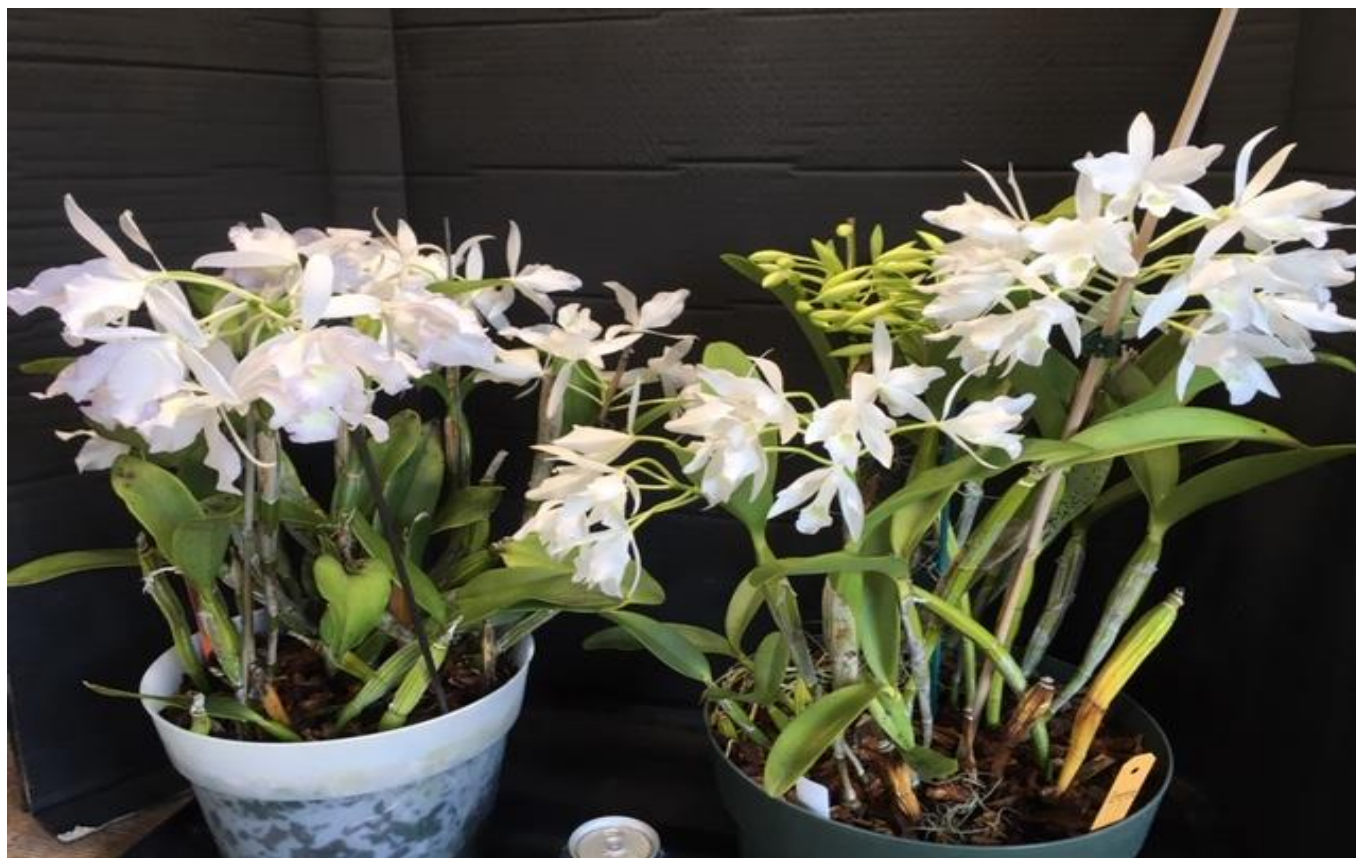
Guar. Skinneri var. oculata (left) and f. alba 'Debbie' right