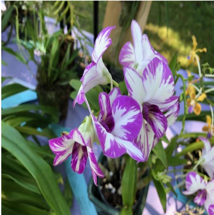
Den. Enobi Purple 'Splash' AM/AOS

Orchid Digest is also moving toward completing and having ready to go. our new website. The launch date is October 1.