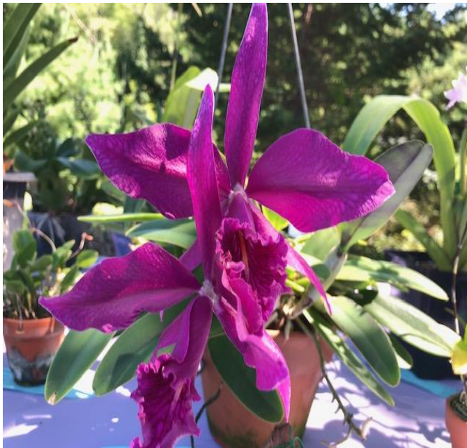
Catt. Maxima (Natural World x Self)