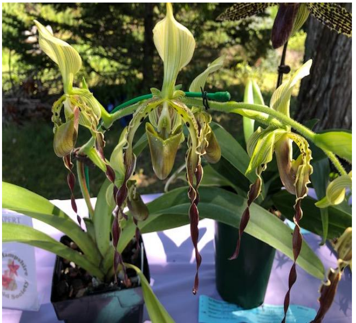
Paph. Parishii 'Twist and Shout'