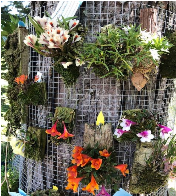
Den. cuthbertsonii Collection

Find your local number: https://us02web.zoom.us/j/85247877513?pwd=bDFFQVlk0a2JTMFJlMlFOV2xyUXVqQT09