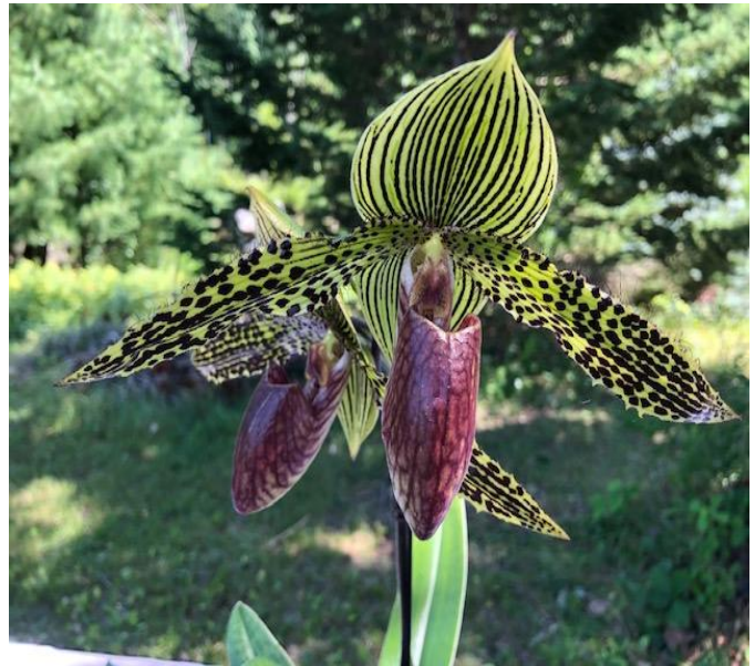
Paph. Iantha Stage 'Jack' AM/AOS