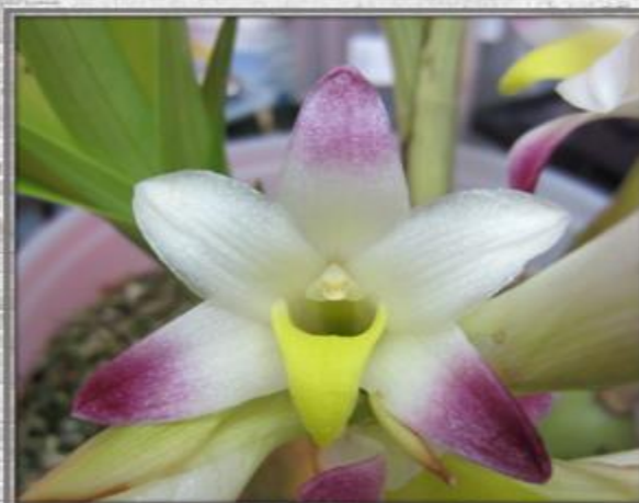
Bob Sullivan - Species; Coelia bella; 3 spikes, 10 flowers and 4 buds, flowers smell like marzipan; from Mexico, Honduras and Belize.