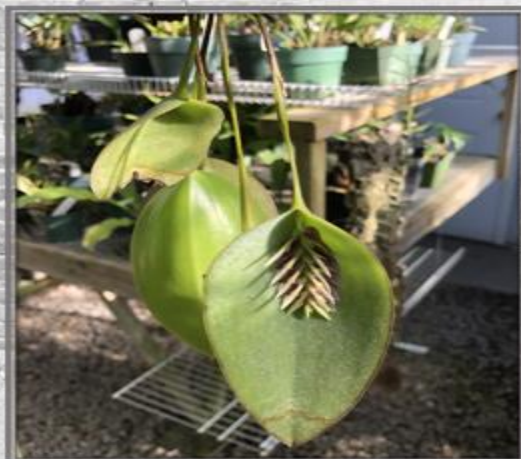
Chuck Wingate - Species; Pleurothallis (Acianthera) pectinata ; from Brazil @ 1200'; grown warm to intermediate