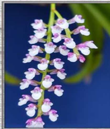
Daryl Yerdon - Species; Schoenorchis gemmata ; Commonly known as flea orchids; indigenous to Java.