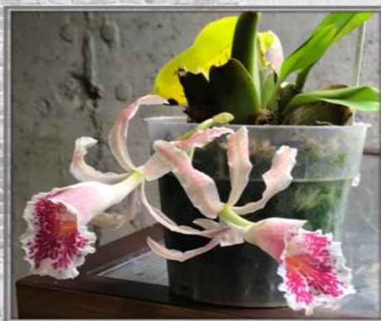
Sue Labonville - Species; Trichopilia suavis ; 5 blooms in all; grown under lights, intermediate, found in Central America and Colombia.