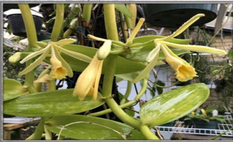
Chuck Wingate - Species; Double flowering Vanilla planifolia ; Mexican flat leaf species; 2nd most expensive spice @ $50 - $200/pound, most expensive is Saffron @ $500 - $5,000/pound from the flower (stigma & styles) of crocus sativus . Vanilla is known to reduce pain in burns and reduce symptoms of claustrophobia.