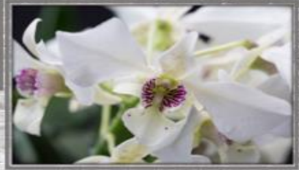
Caren Savone - Hybrid; Dendrobium Royal Wings (Roy Tokunaga x Silver Wings)