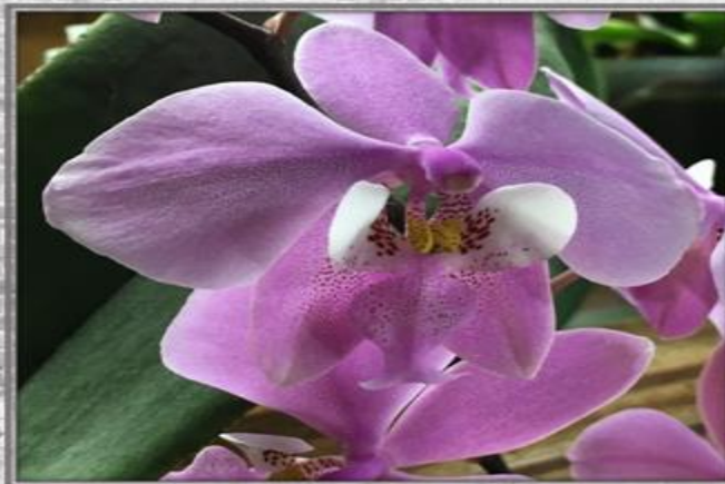
Shoshana Boar - Species; Phal. schilleriana from Sabah; one of the most sought after & popular of all Phal. Species producing displays of gracefully cascading fragrant flowers; from the Malaysian state of Sabah - NE section of Borneo.