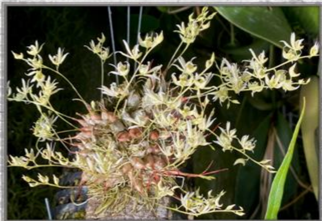
Chuck & Sue Andersen - Species; Dendrobium gregulus; Cool grower from NW Thailand; Blooms during the Winter dormant season.