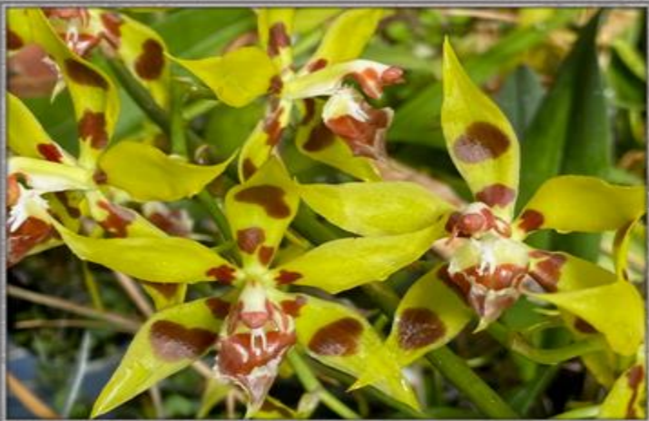
Chuck & Sue Andersen - Species; Odontoglossum cruentum ; A greener form than typical - good for March; from Ecuador.