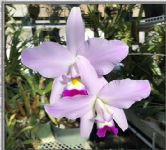
Chuck Wingate - Species; Laelia anceps 'SanBar Pink Flambeau' 83 AM/AOS; from Mexico, Guatemala, Honduras; varied habitat warm-cool, shady-sunny; easy to grow.