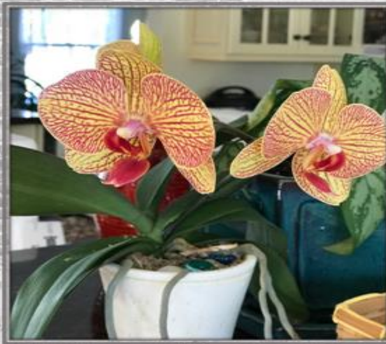
Sue Labonville - Hybrid; No-Name Phal; Suspect it could be Baldwin's Kaleidoscope; grown on windowsill.