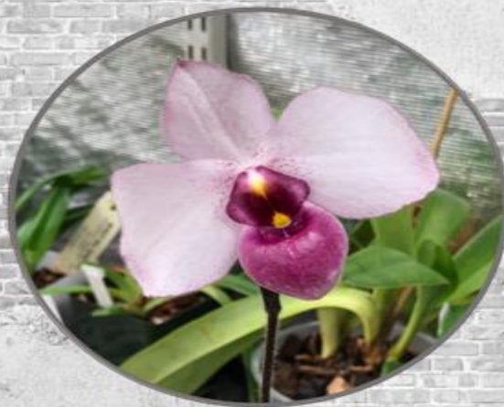
Sue Labonville - Species; Paph. delenatii var. vinicolor ; grown intermediate under lights.