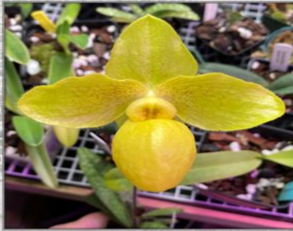
Bob Cleveland - Hybrid; Paph. Gold Dollar x armeniacum