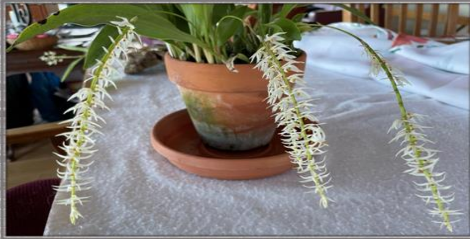
Lee Brockmann - Species; Dendrochilum glumaceum ; From Philippines & Indonesia; Grown in cool greenhouse; water well while growing, less when not; don't allow to dry out.