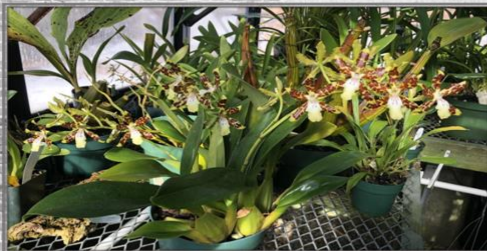
Chuck Wingate - Species; Oncidium maculatum ; from Mexico thru Central America; grown intermediate, bright light.