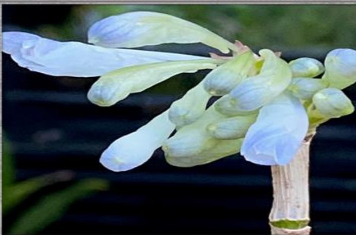
Chuck & Sue Andersen - Species; Potential new Dendrobium Species; Sky Blue Dendrobium related to lawesii ; from New Guinea and Bougainville; just opening 1 st bloom.