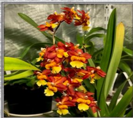
Sue Labonville - Hybrid; Oncidium Volcano Midnight 'Volcano Queen'; grown intermediate, under lights.