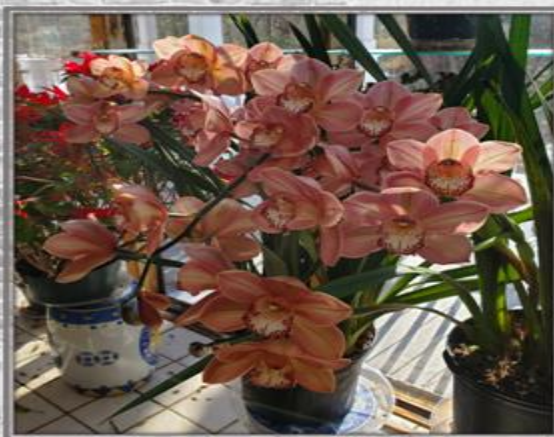
Chuck Crisler - Hybrid; Cymbidium Skukuza