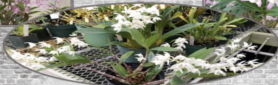
Chuck Wingate - Species; Dendrobium kingianum 's - An assembly of Kings; from Australia; grown cool