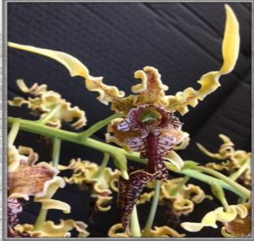
Lee Coolidge - Species; Dendrobium spectabile ; first bloom for me; 5 spikes; great fragrance; from Papua, New Guinea and Solomon Islands.