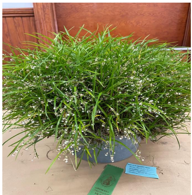
Gomesa radicans 'Jack's Kiersten'