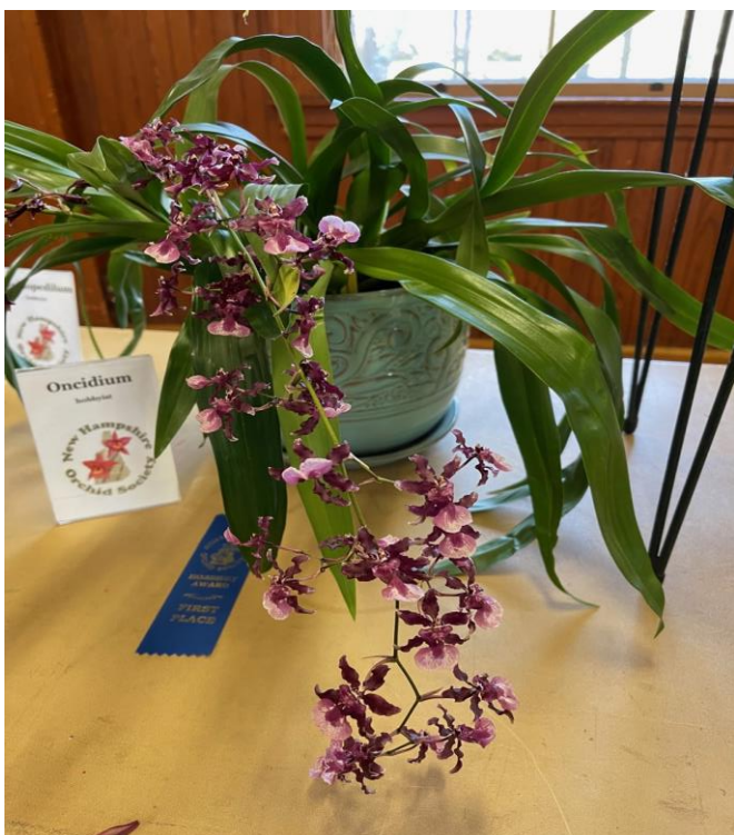
Onc. Heaven Scent 'Sweet Baby'