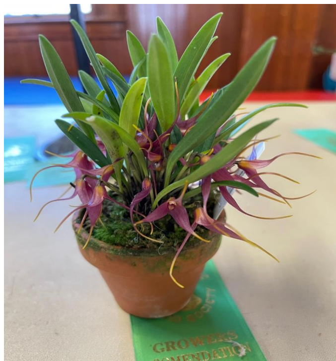
Masdevallia roceola 'Susan'