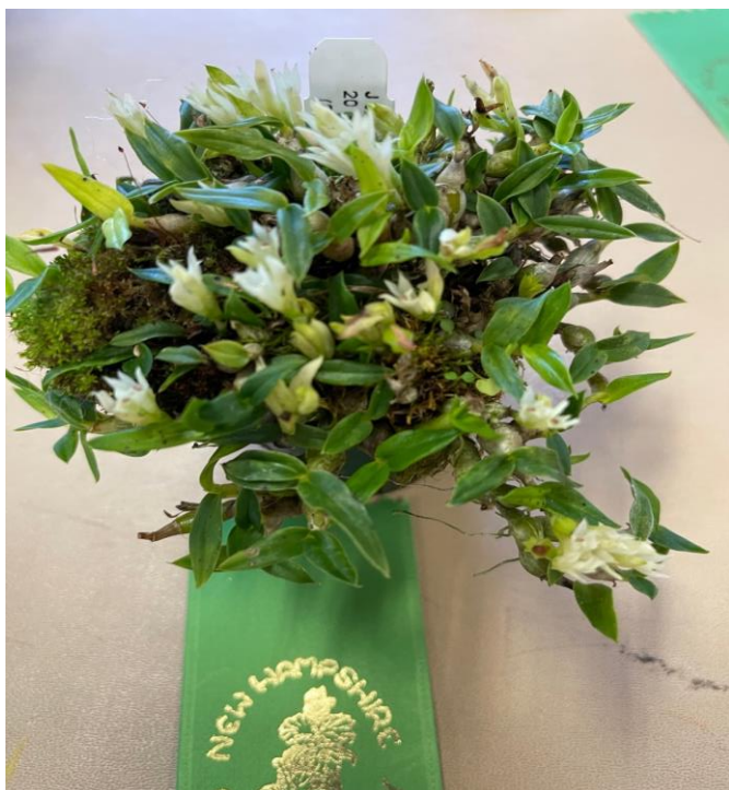
Dendrobium parvulum var. huliorum