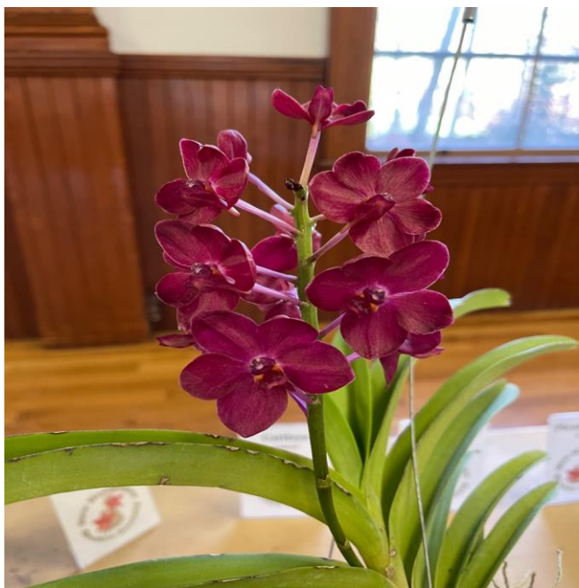
Vanda Roll All Red