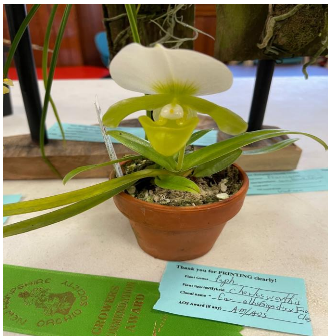
Paph. charlesworthii f. alba AM/AOS