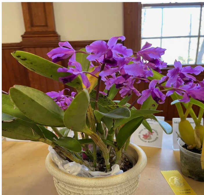
Catt. No ID