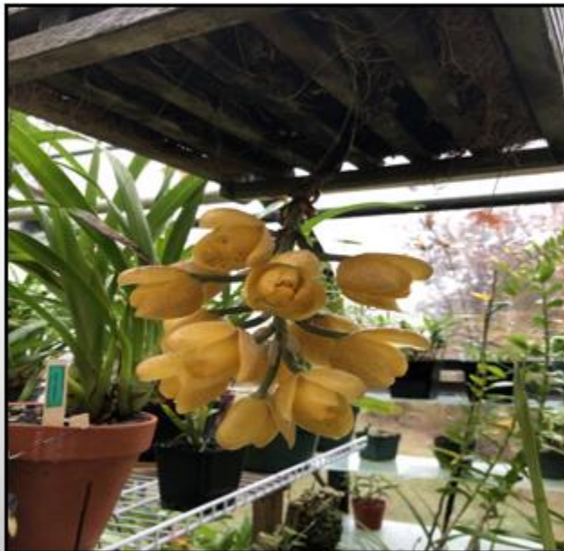
Chuck Wingate - Acineta barkeri