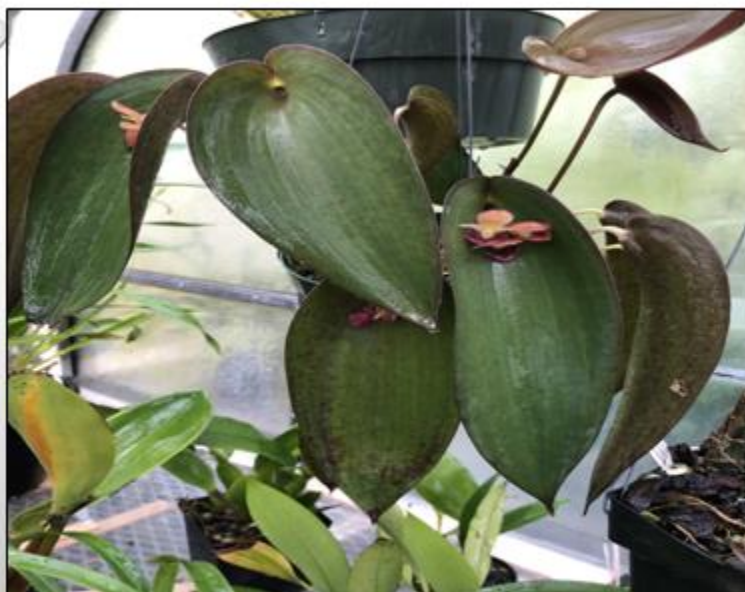
Chuck Wingate - Pleurothallis cyanea