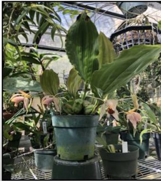
Chuck Wingate - Coelogynw xyrekes