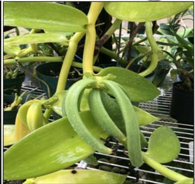
Chuck Wingate - Vanilla planifolia