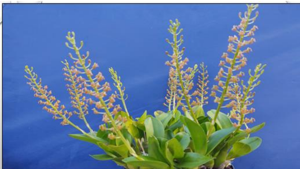
Daryl Yerdon - Liparis grossa - 14 inflorescences with approx. 500 flowers and buds.