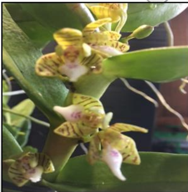
Leigh Coolidge - Trichoglottis geminate ; 47" tall, 23 flowers and 24 buds