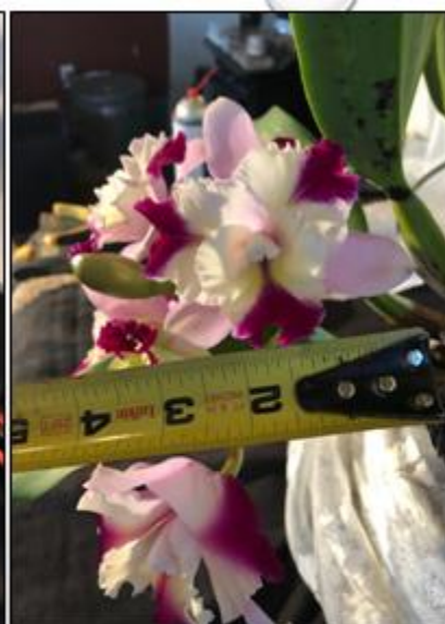
Nancy Shedrick - Lc. Marris Song - Hobbyist; windowsill eastern/southern exposure; intermediate; fragrant, owned for 20 years