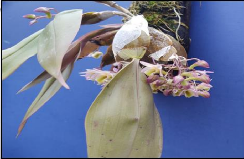
Daryl Yerdon - Dendrobium pseudolamellatum - 38 flowers and 4 buds on 12 inflorescences; 2.0cm wide