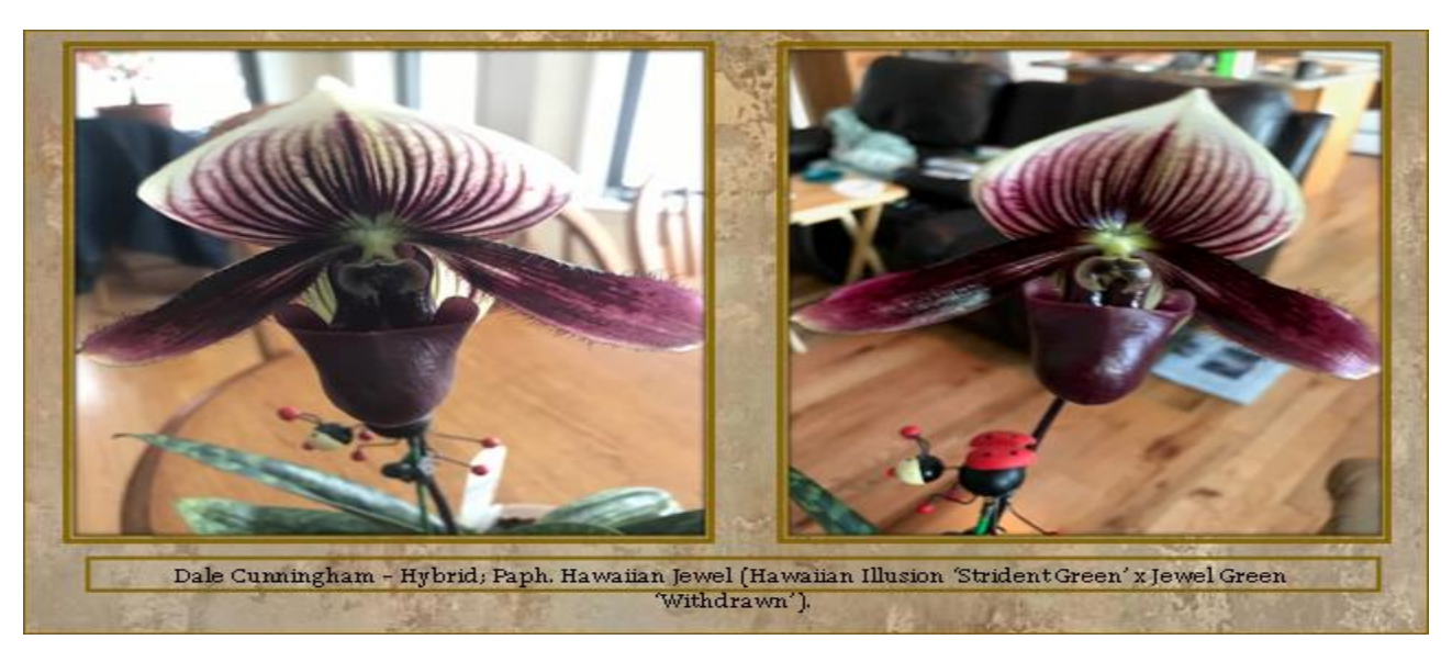
Page 4 of 19