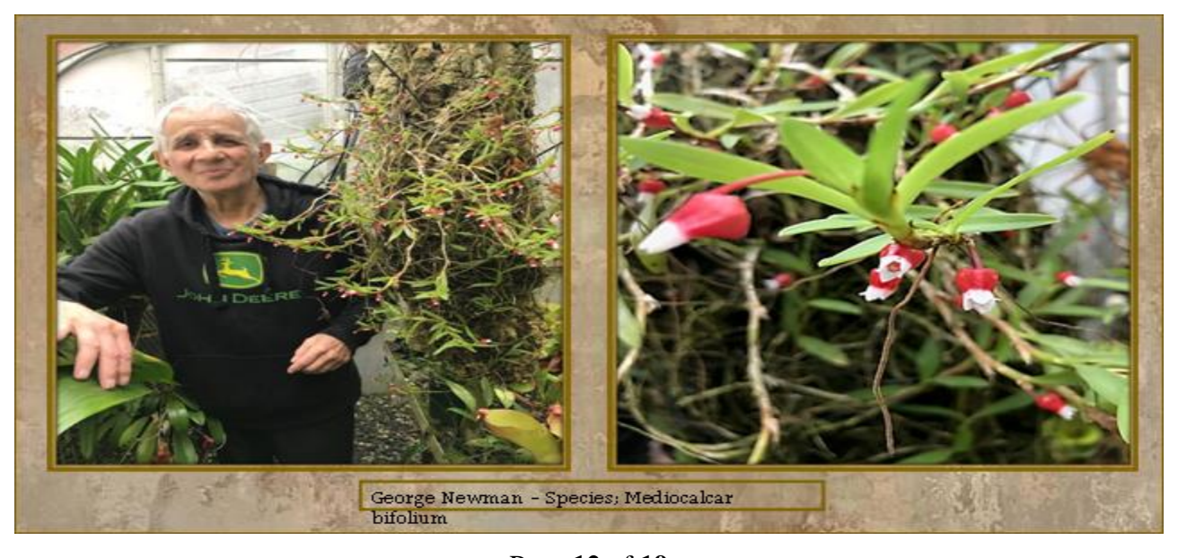
Page 12 of 19