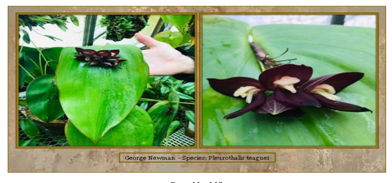
Page 11 of 19