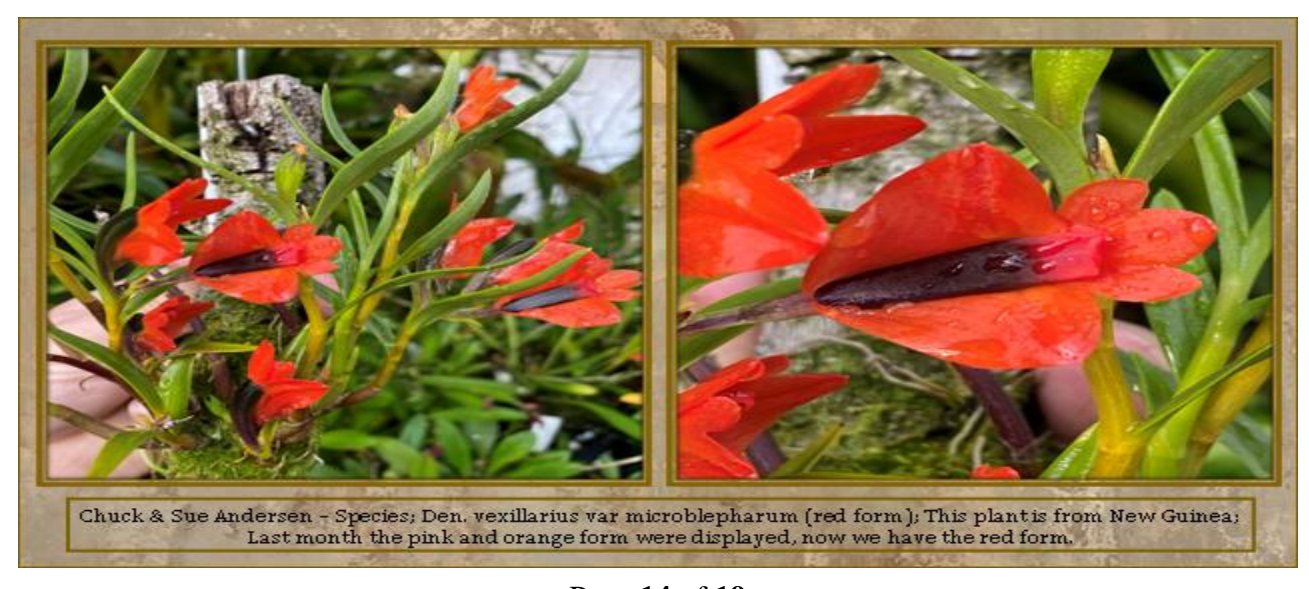
Page 14 of 19