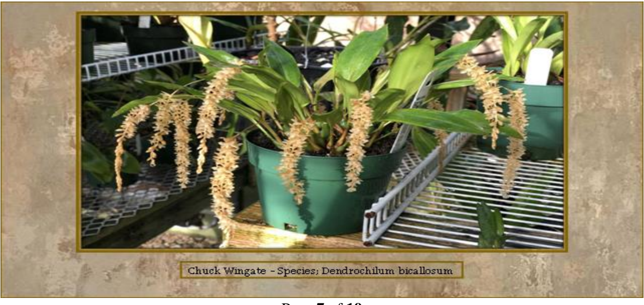
Page 7 of 19