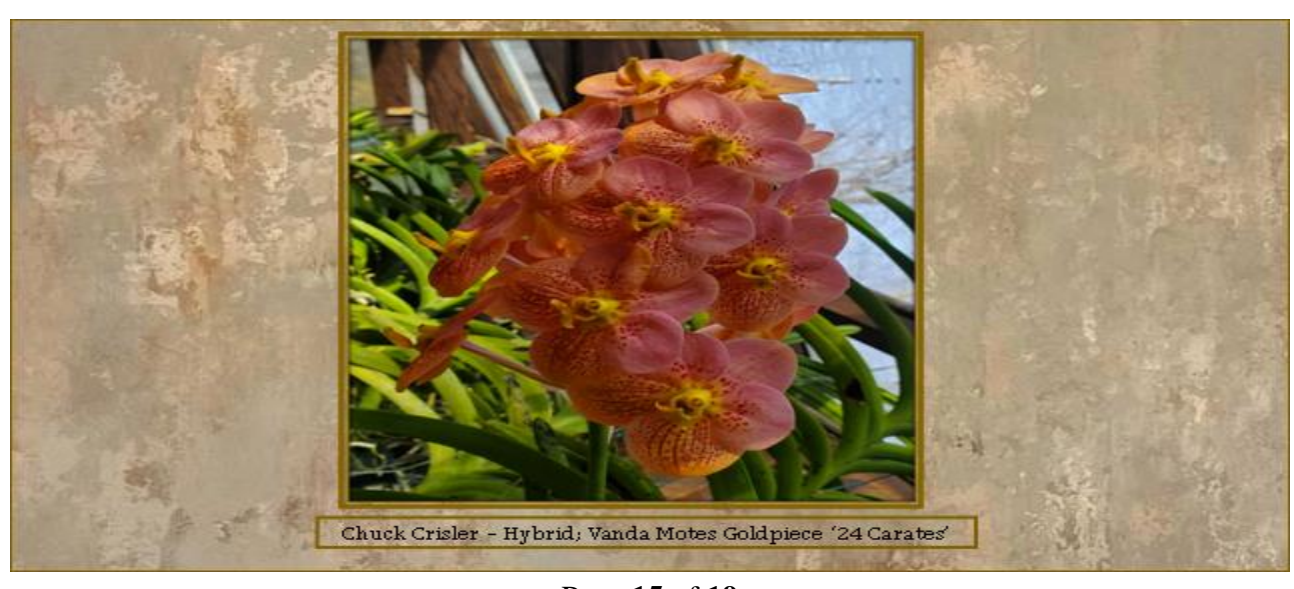
Page 15 of 19