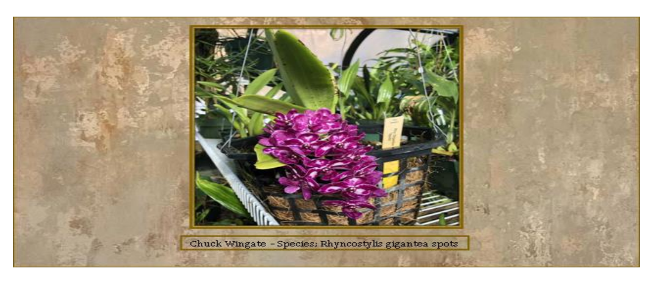
Page 8 of 19