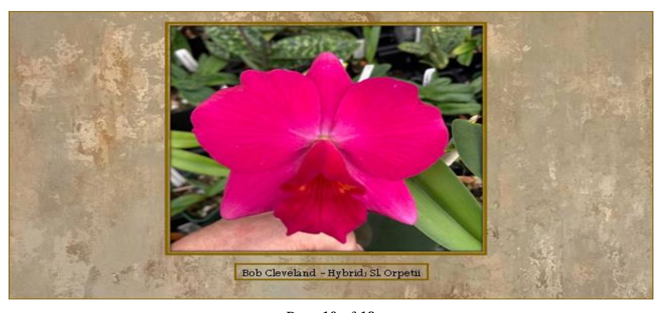
Page 10 of 19