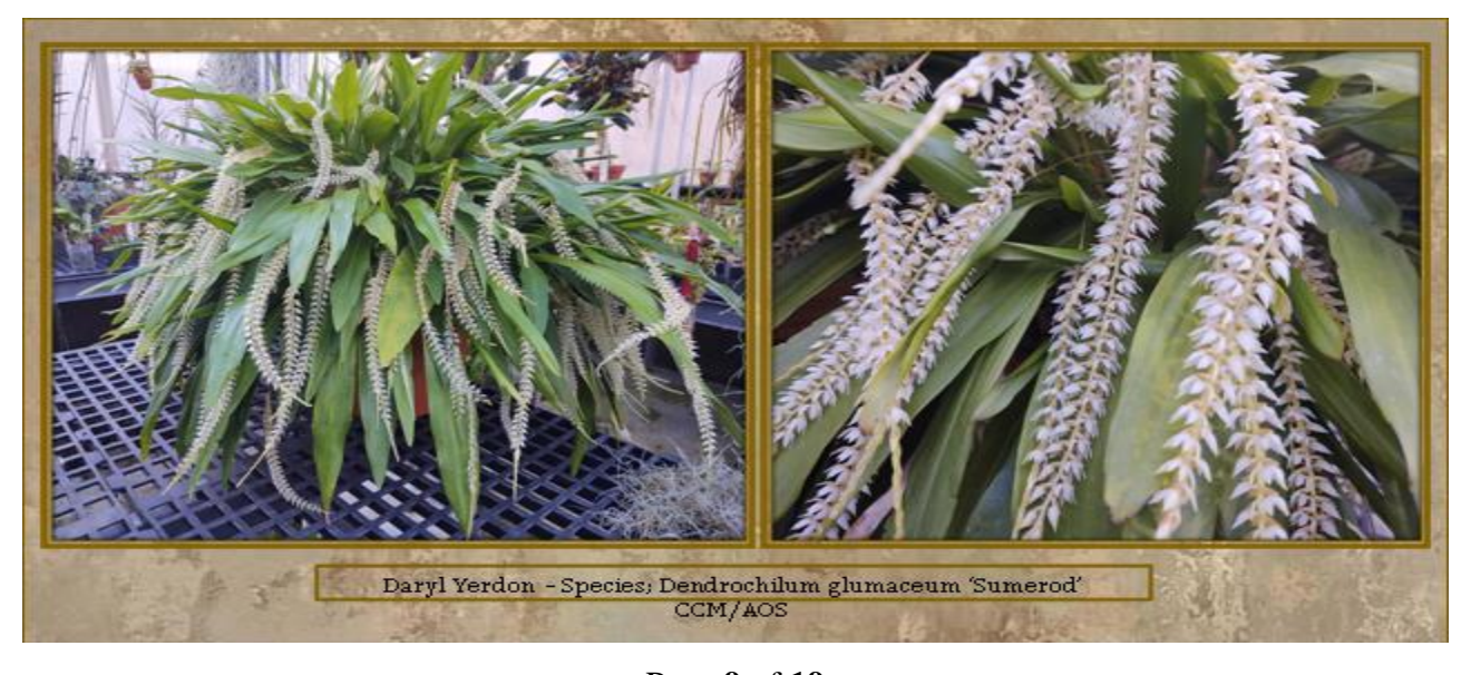
Page 9 of 19