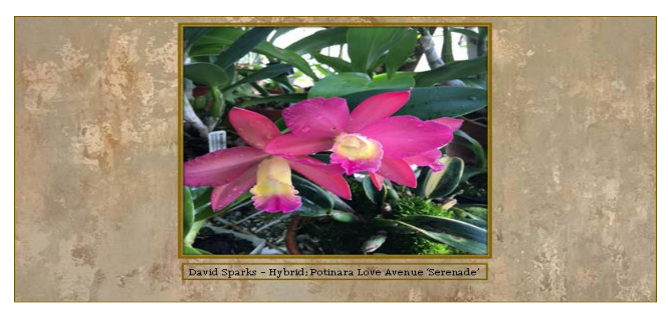
Page 6 of 19