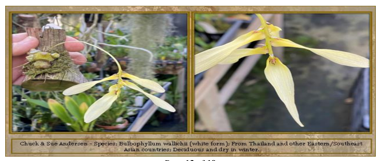
Page 13 of 19