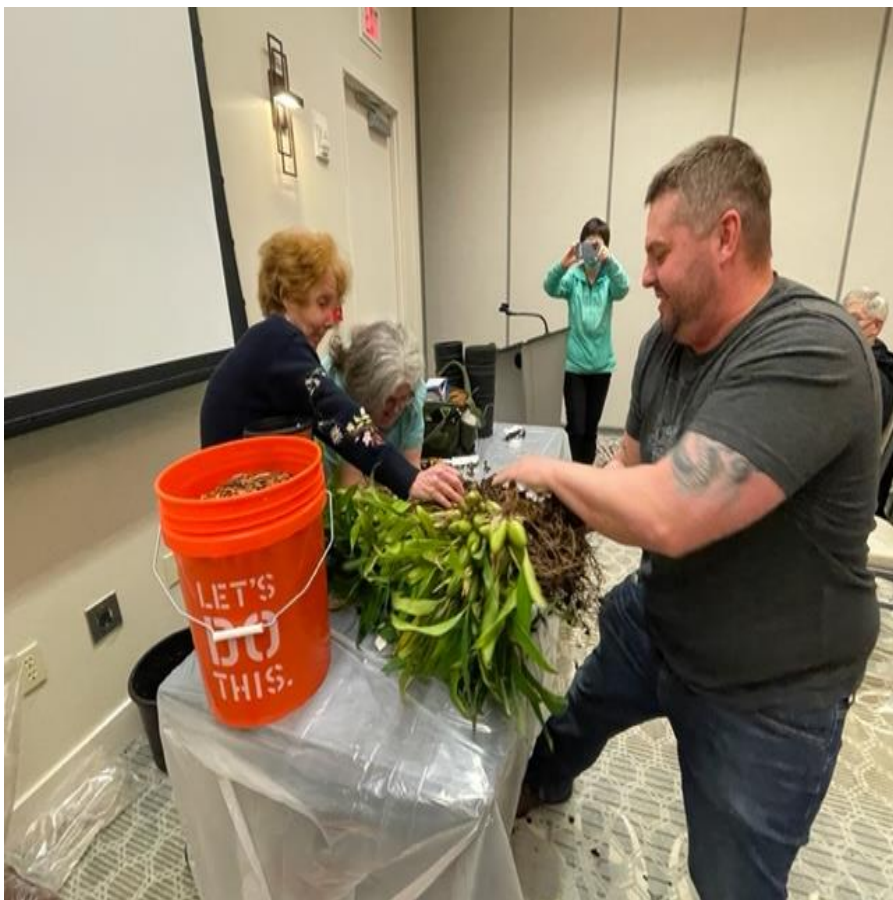
Workshop on making plant divisions using the specimen Coelogyne the Society purchased from Jack Mulder last fall