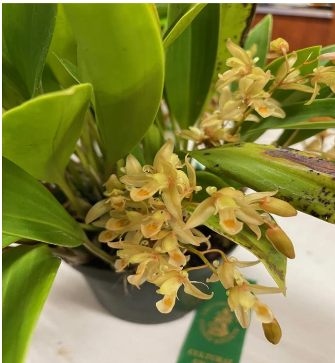
Chelonistele sulphura 'Susan' CHM/AOS