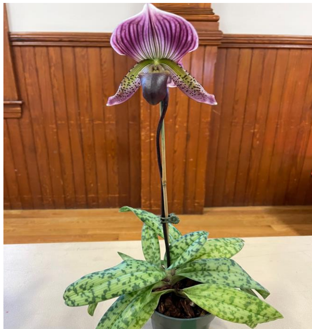
Paph. Hsingying Viny