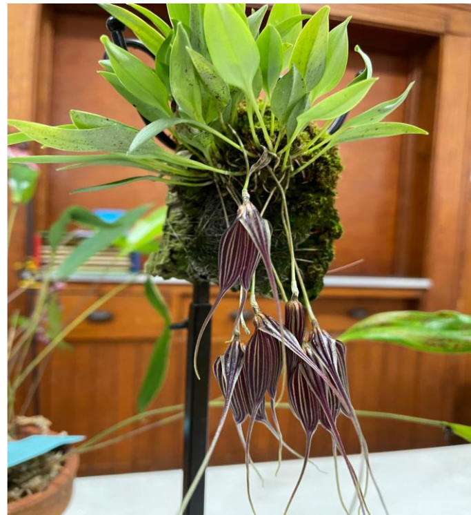
Masdevallia putula 'Sunset'