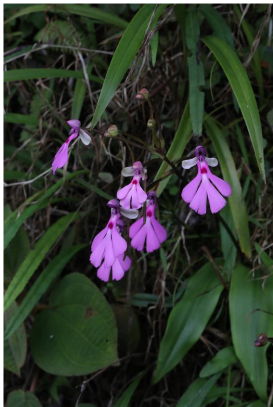
Cyrtorchis lowii Madagascar

Would you like to see orchids growing in nature, and experience the nature, food and culture of places you have just dreamed about? Travel with the Orchid Conservation Alliance to some of the most amazing places!