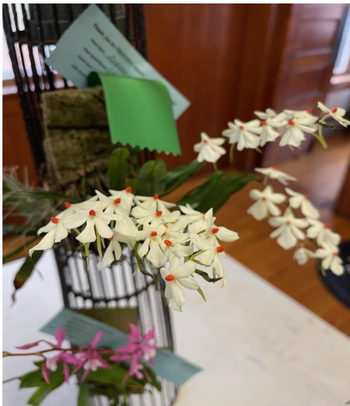
Aerangis luteo alba