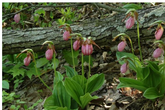
A colony of the pink ladyslipper orchid, Cypripedium acaula Ohio, USA.