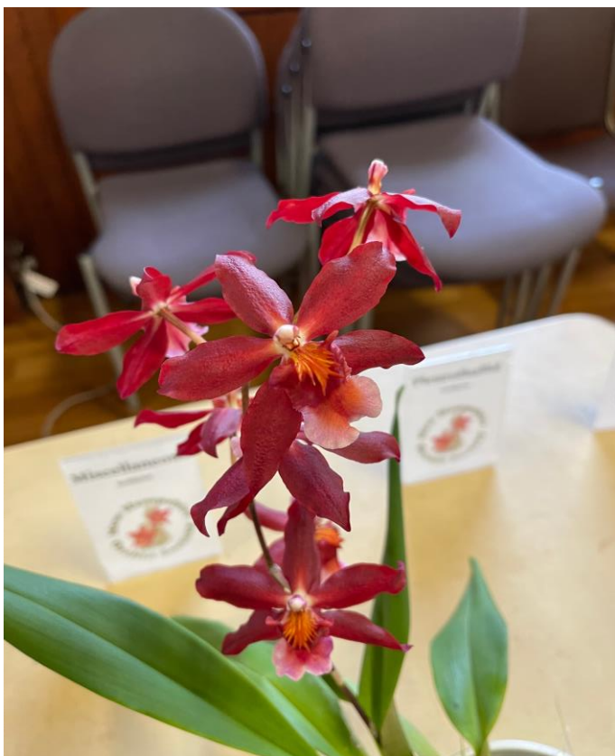
Wilsonara Frego 'Ideal'