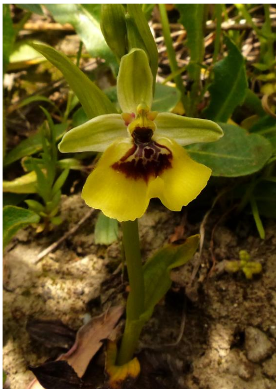
Ophrys fuciflora ssp. lacaitae Sicily