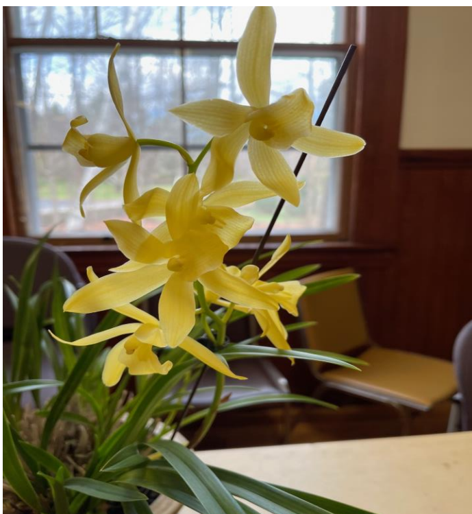
Cym. Golden Elf