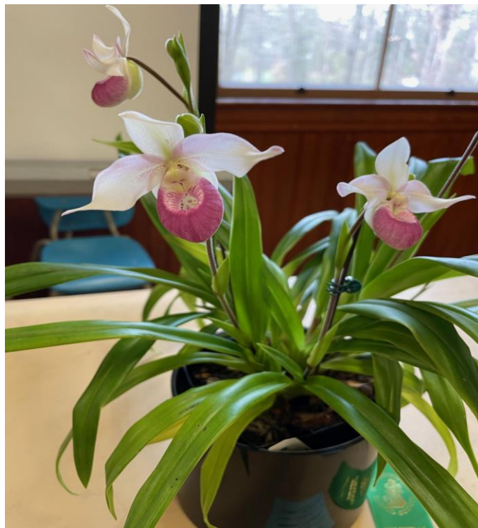
Phrag Cardinale Wilcox AM/AOS