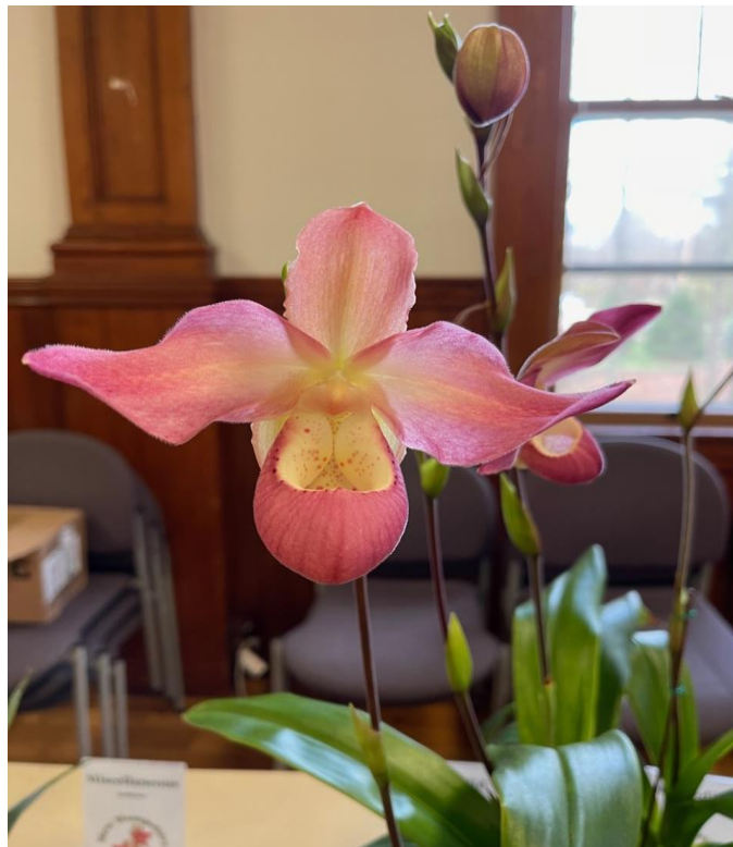
Phrag. Peroflora's Spirit