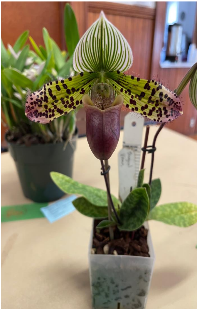
Paph. Magical Venus