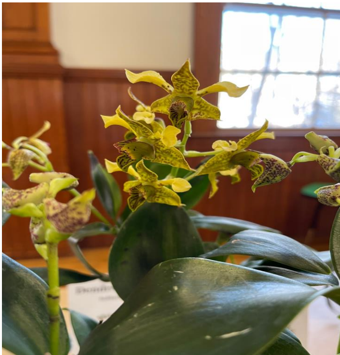
Den Kalia Quintax 'Miva Abracadabra'