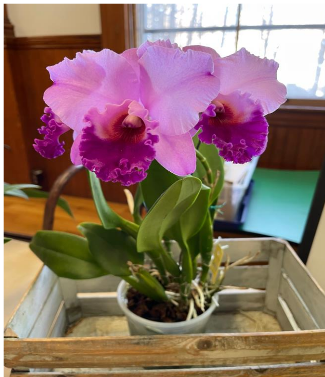
Blc. Myrtle Beach x Lc. Liptonis