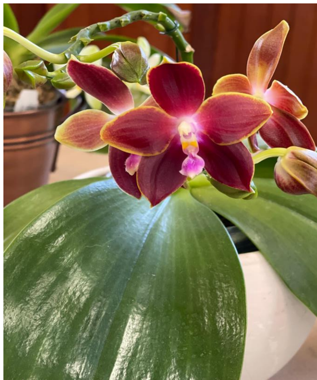
Phal. Tuingshin Fly Eagle x KS Happy Eagle