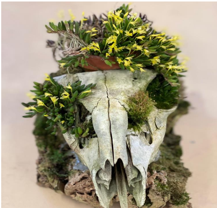
Pleurothallis leptofolia 'Gold Country'