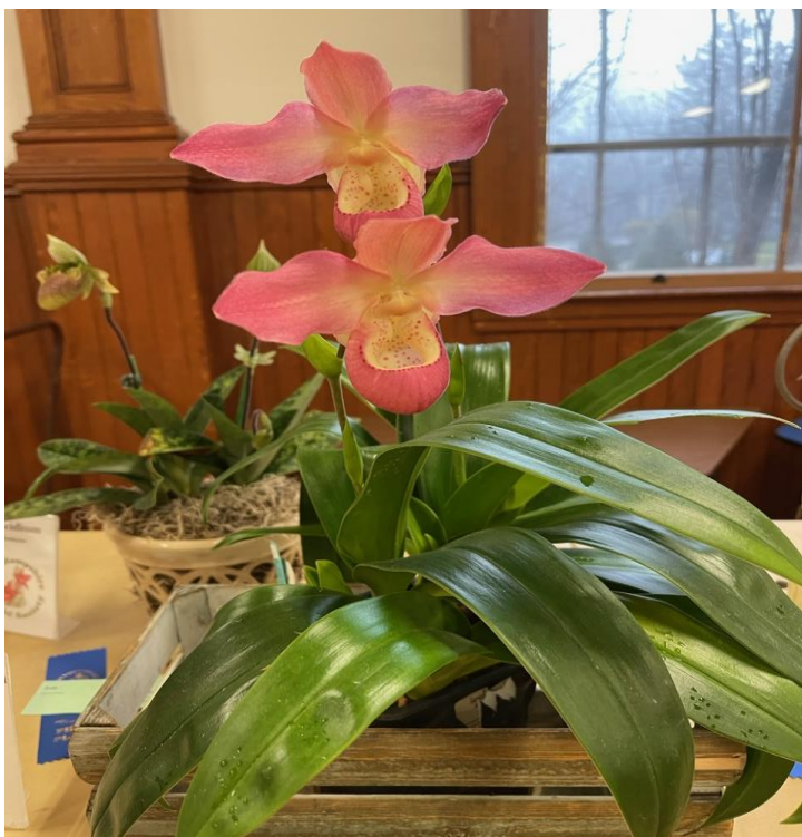
Phrag. Peruflora's Spirit