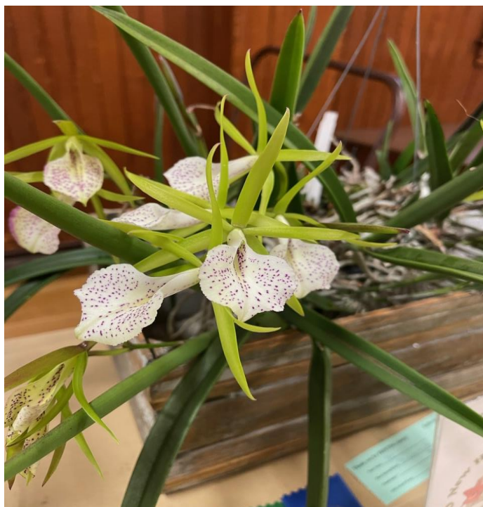
Bc. Binosa x Brassavola Little Stars