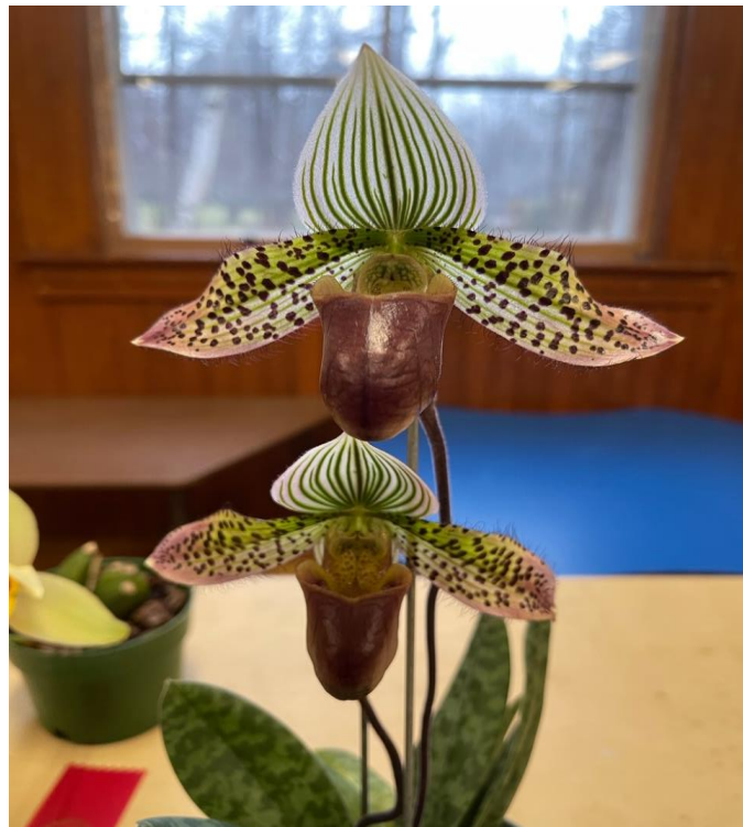
Paph. Magical Venus