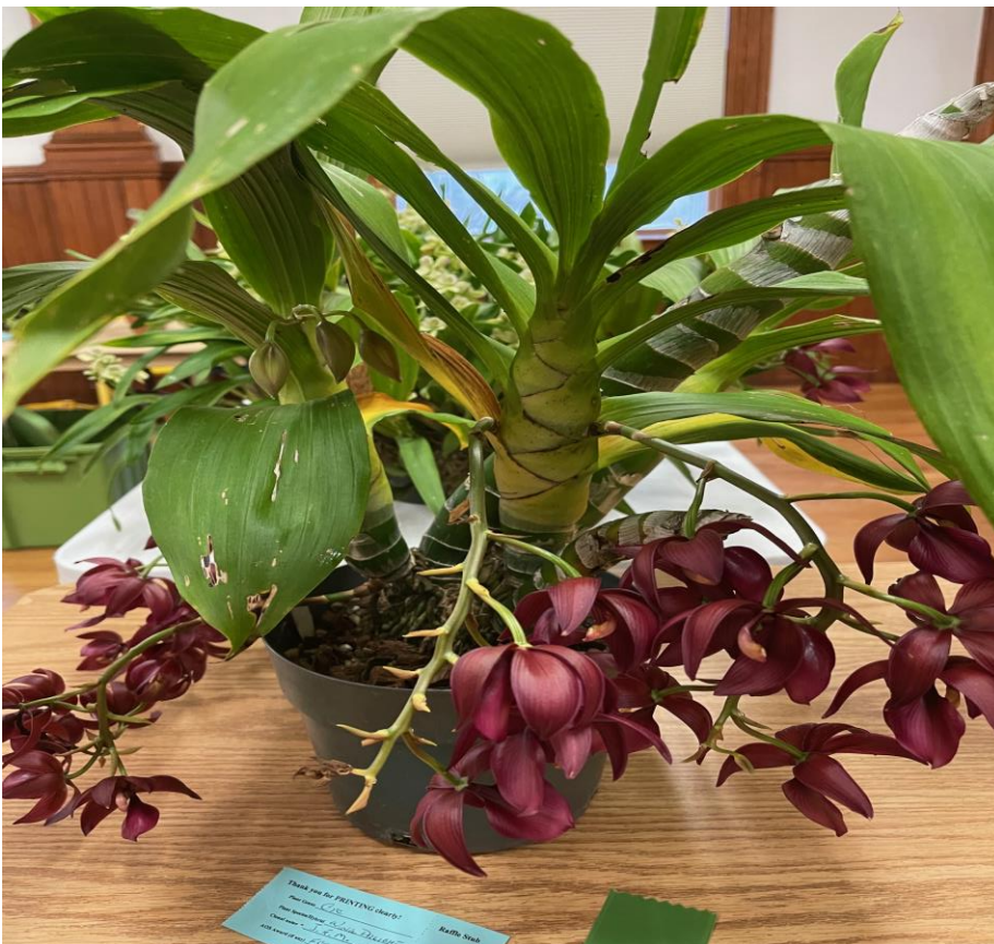
Cyc. Wine Delight J.E.M. FCC-CCM/AOS