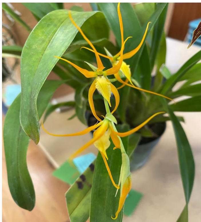
Brassia (Ada) pozoi xanthina