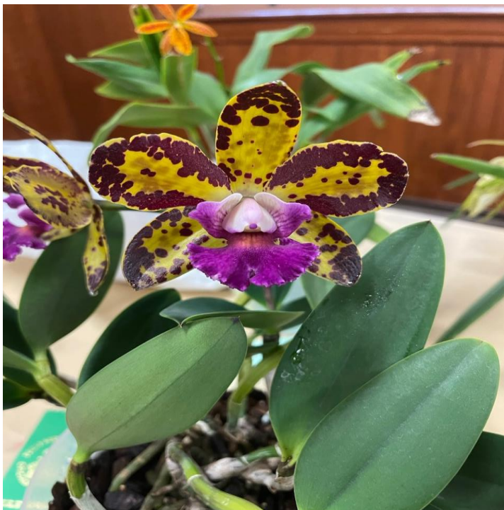
Pot. Sunspot Gem 'SVO Sunspot' x Slc. Katherine Clarkson "SVO" HCC/AOS