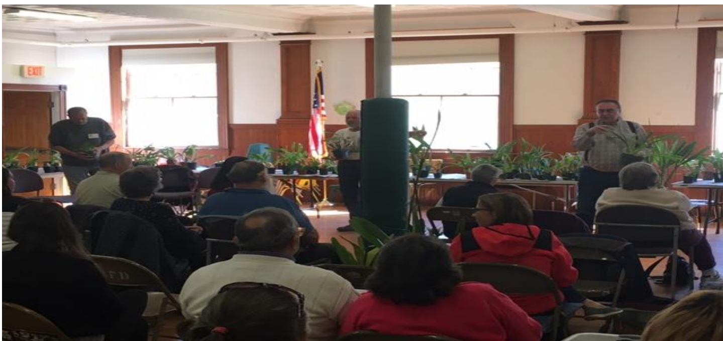
A good turnout for the Cataldo's special auction