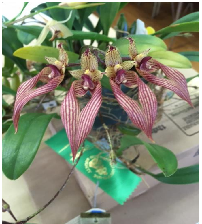
Bulb. A-doribil Candy Ann 'D&B'