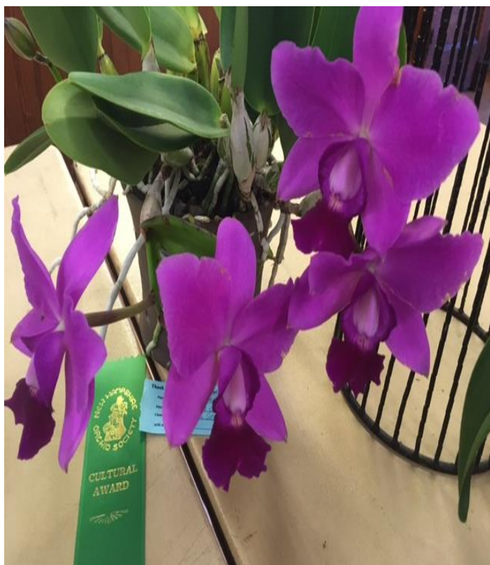
Cattleya Aloha Case 'Hawaiian Style'