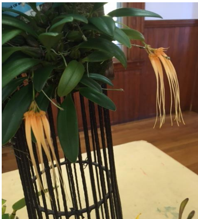
Bulb. tingabarinum var. aureum