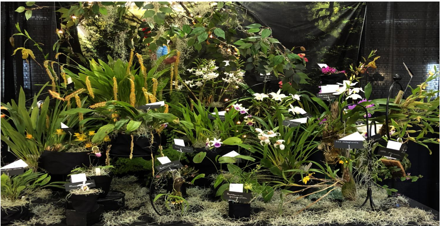
NHOS Exhibit @ MOS Show

Miscellaneous – Terrestrials Phcal. Kryptonite 'Parkside' HCC/AOS (Cal. Rozel x Phaius. Tankervilleae) # 1 Daryl Yerdon