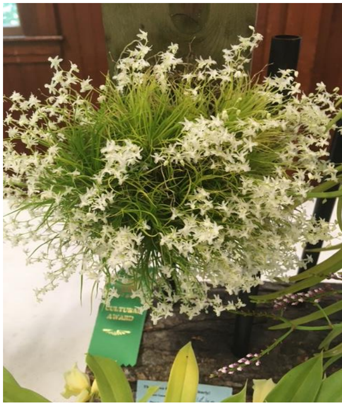
Phymatidium tillandsiodes (syn. Falcifolium)