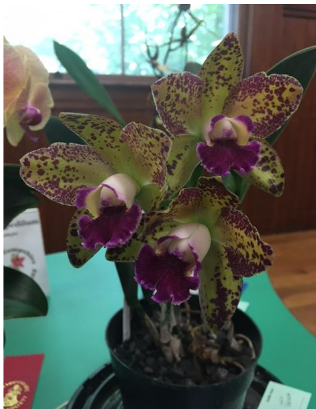
Bc. Waianae Leopard 'Ching Hua'