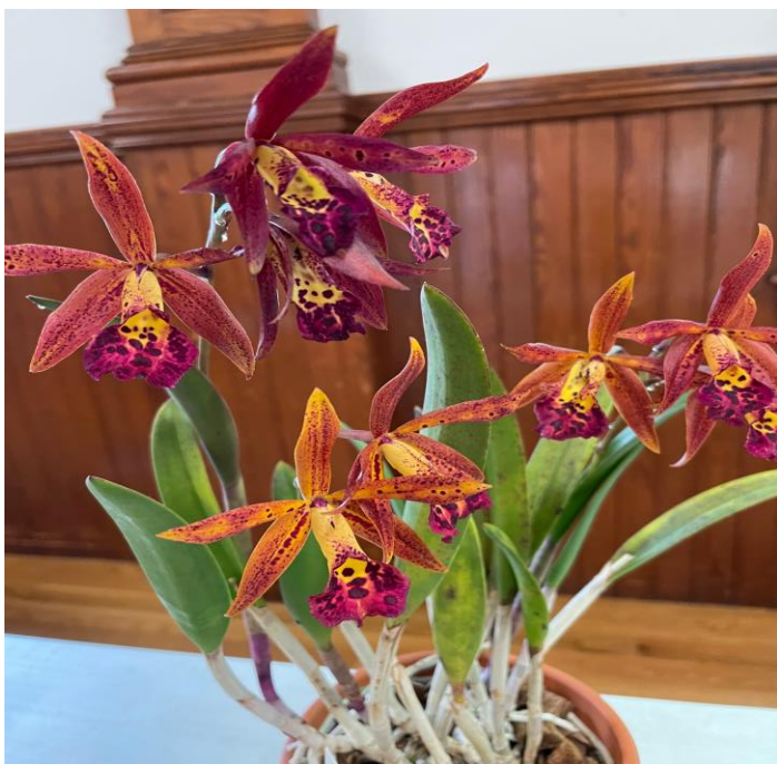
C. Rustic Spots 'FTsR40s'