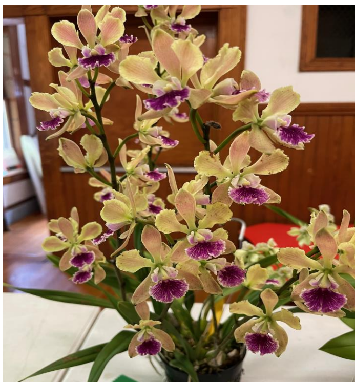
Epcty. Serena's Tinkerbel 'Paradise'