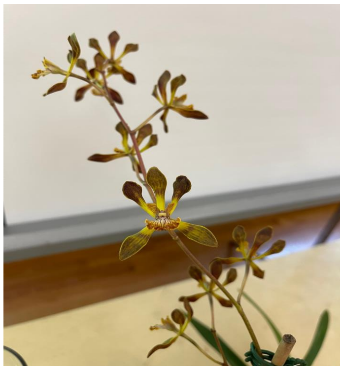
Encyclia parviflora x Sib