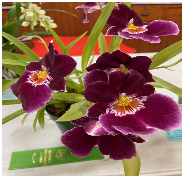
Miltonia Red Woodham 'Wendy'