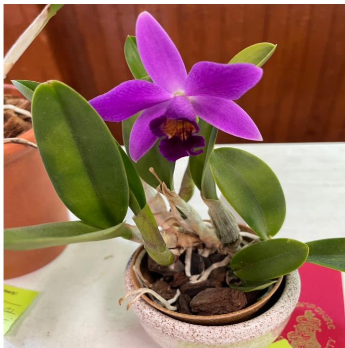
C. Amethyst Star 'Parkside'