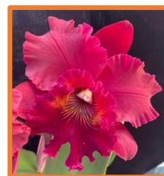
Rlc. Heaven's Gate 'Crystelle' FCC/AOS

After getting married almost twenty years ago and moving into our current years afterwards, I finally had the opportunity to “design” indoor and spaces for my orchids. I continued using Ikea pine shelving and fluorescent an unused upstairs bedroom. Eventually this space would become the property our daughters and the orchids, shelving, and lights were moved to the with my fingers crossed. In some ways the basement is a good space due to its temperature stability, but that particular temperature was still too cold for most if not all of my plants. Some plants were more tolerant than others. Although not appreciated at the time, temperature control was only one of the challenges that would not be properly addressed until later. Did I forget that these are tropical plants? My selective memory has protected me from the reality of the ensuing botanical carnage.