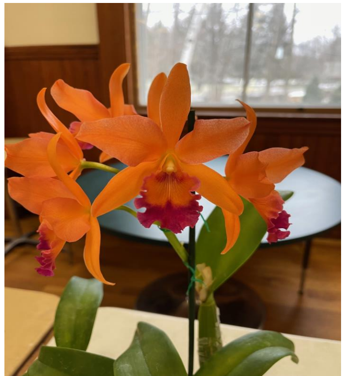
Lc. Love Passion 'Orange Beauty' x Blc. Carolina 'Orange D'or Lenette'