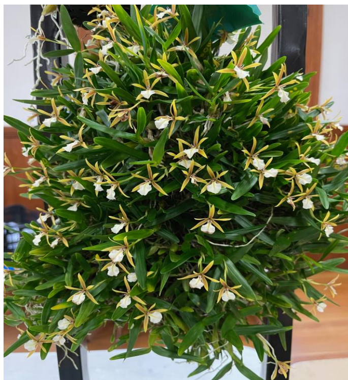
Dinema (Encyclia) polybulbon