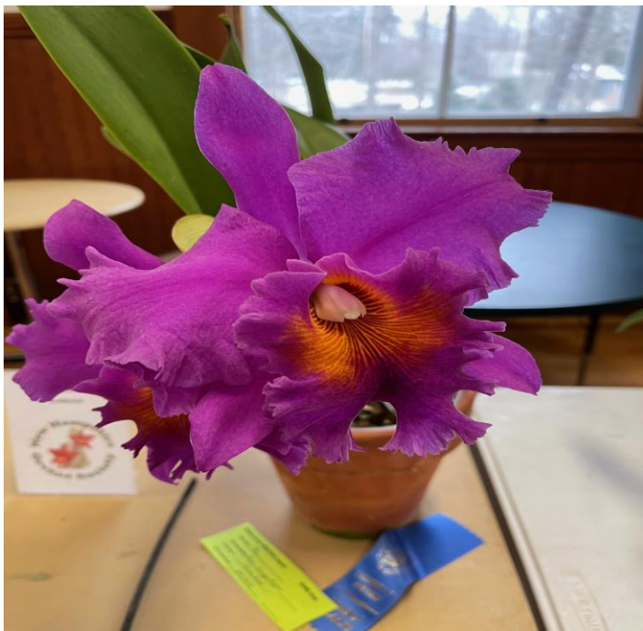
Blc. Mem. Crispin Rosales 'Pine Knot' AM/AOS