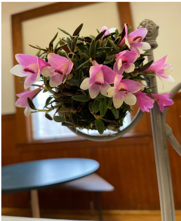
Den. cuthbertsonii ('Lafayette' x 'Purple Jungle')