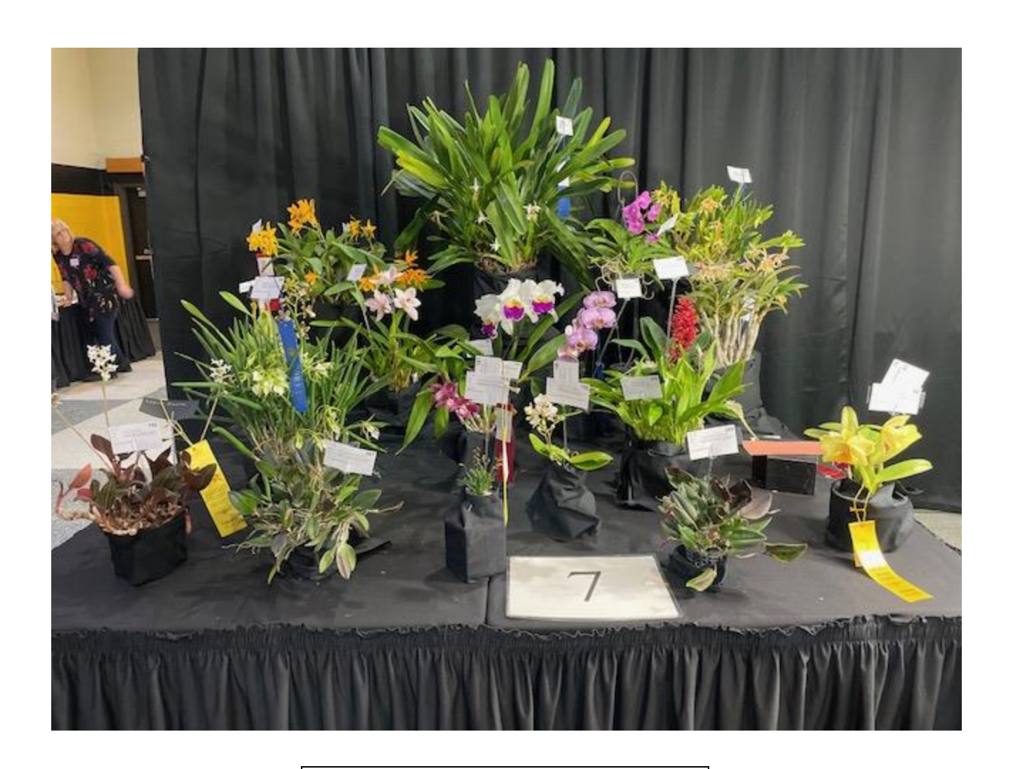
NHOS Exhibit at Amherst OS Show