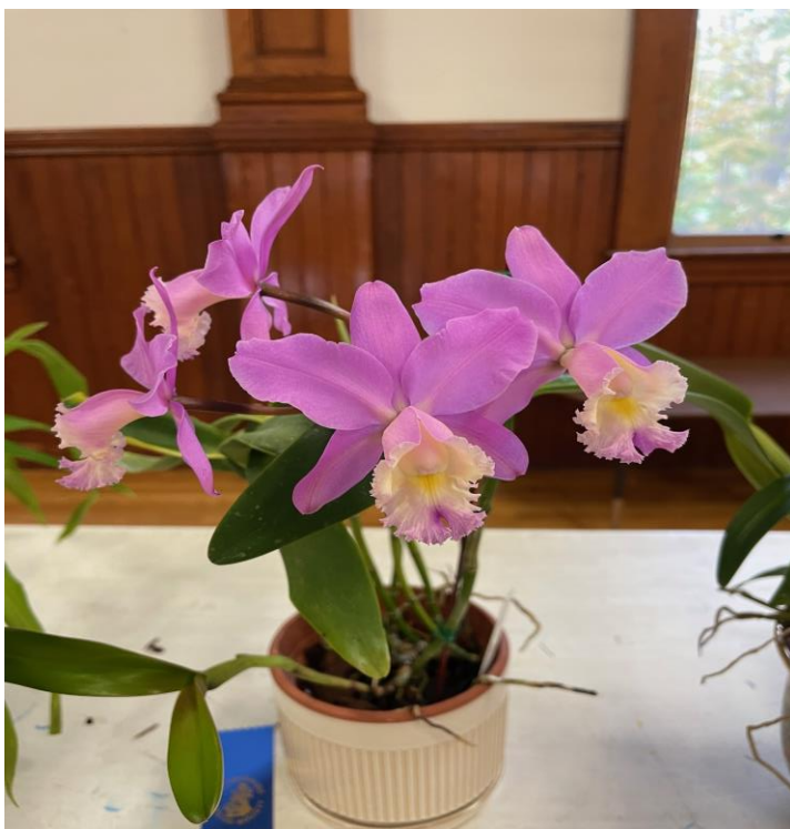
Cat. Jungle Nobility