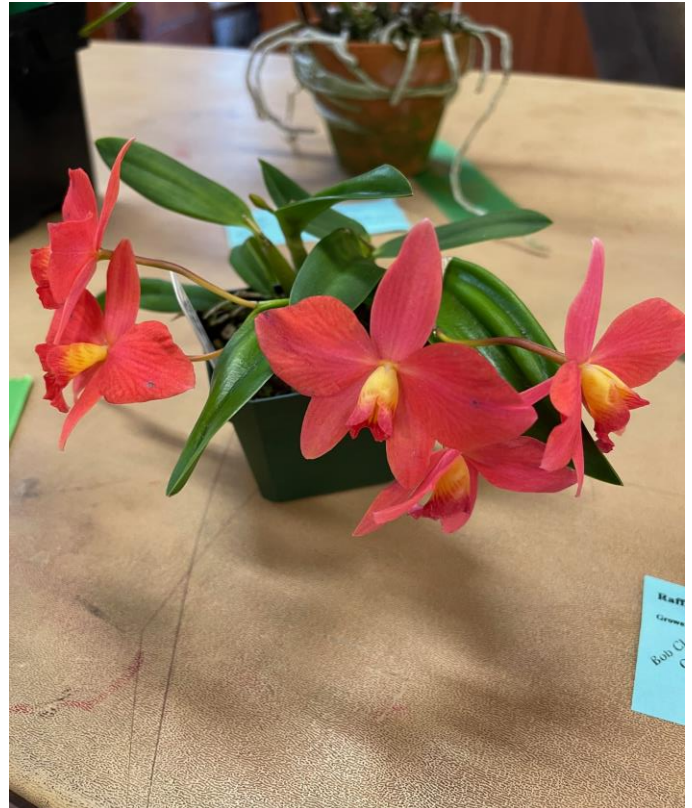
Sl. Tiny Rubies x Orpettii