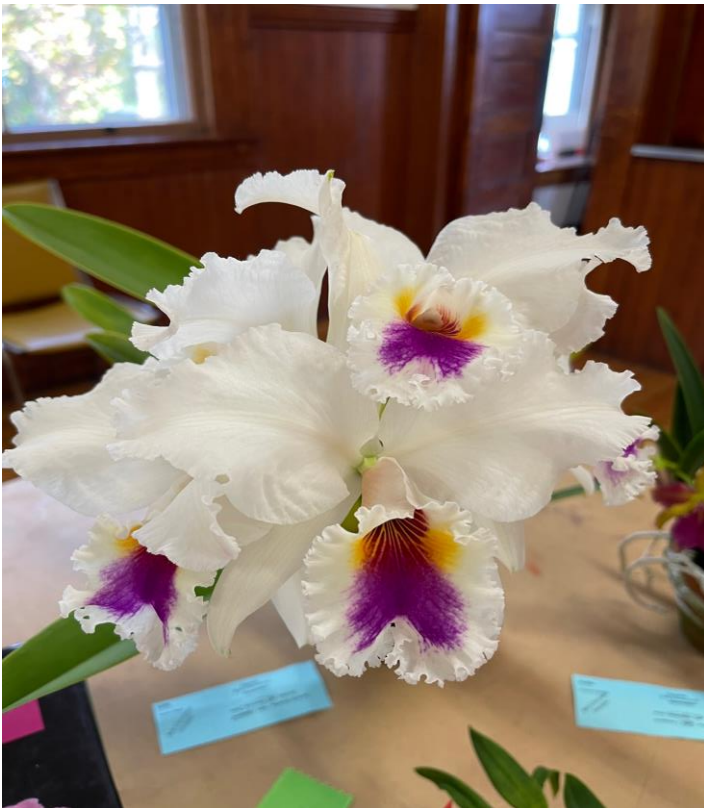
Cat. labiata semi alba 'Bonnybriae'