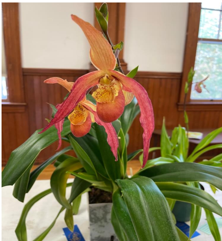
Phrag. Fliquet 4N