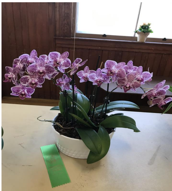
Phal. No ID