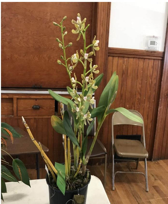
Anacheilium [Ahl.] tigrinum