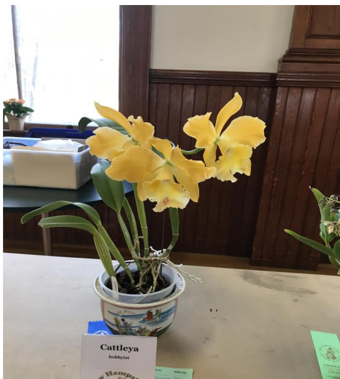
C. Rhyncholaeliocattleya 'Ingrid de Portillo'